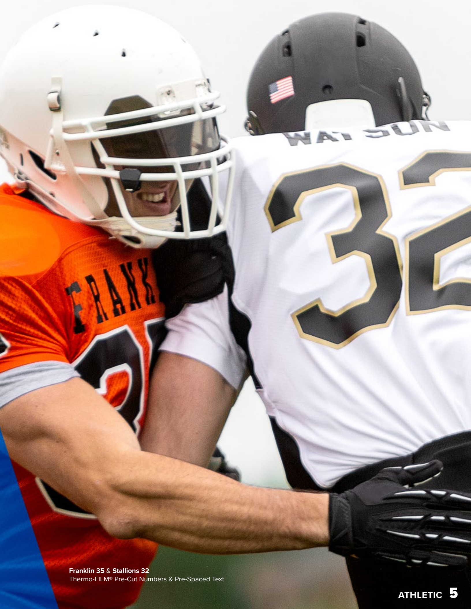
Franklin 35 & Stallions 32 Thermo-FILM® Pre-Cut Numbers & Pre-Spaced Text