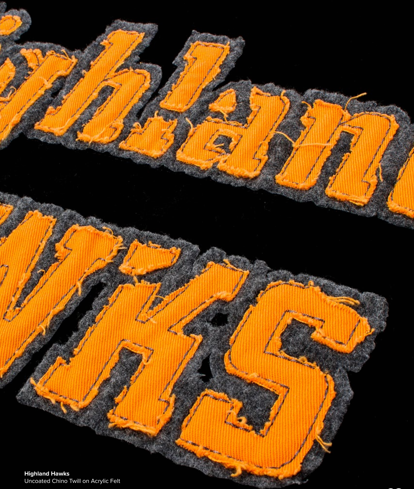
Highland Hawks Uncoated Chino Twill on Acrylic Felt