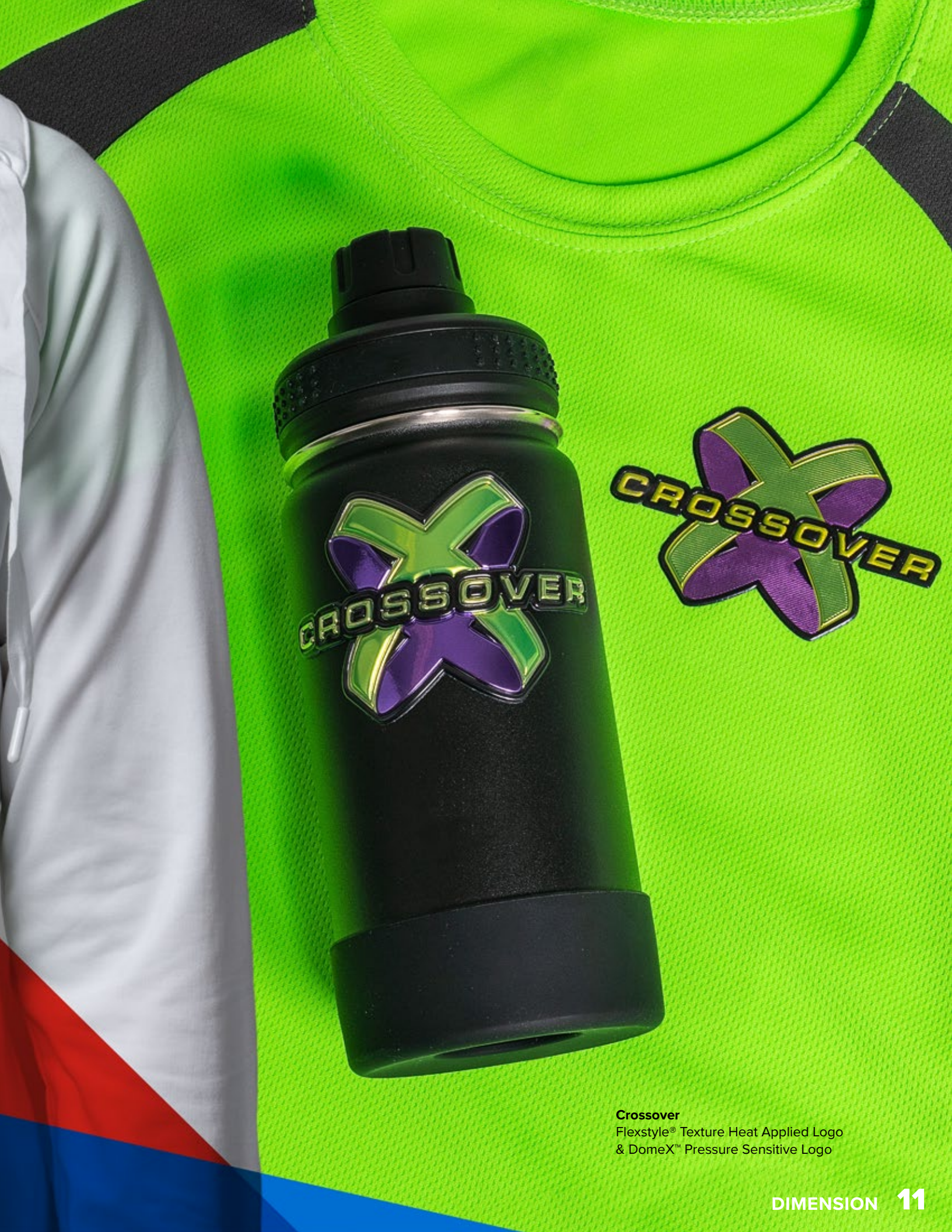
Crossover Flexstyle® Texture Heat Applied Logo & DomeX™ Pressure Sensitive Logo