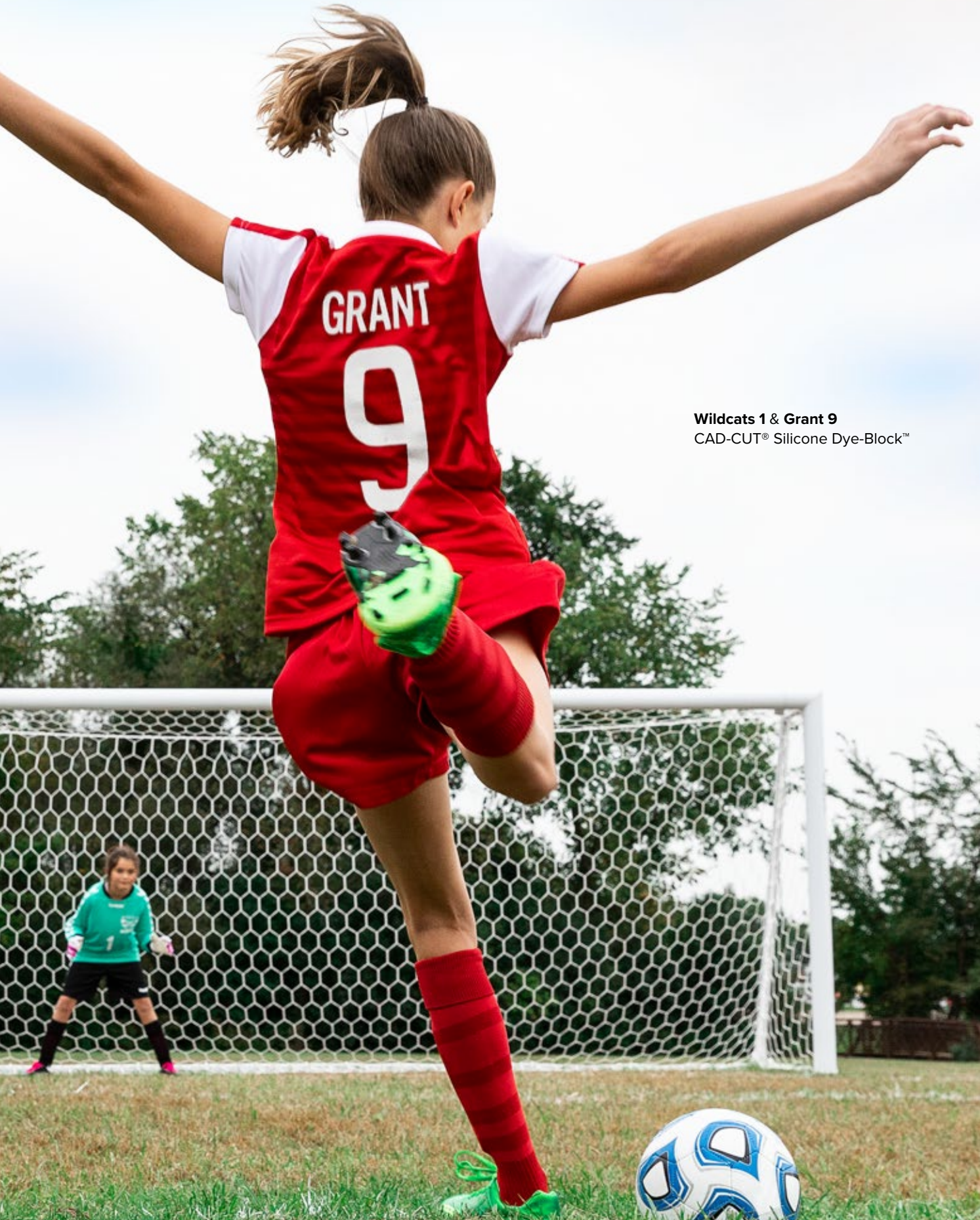
Wildcats 1 & Grant 9 CAD-CUT® Silicone Dye-Block™