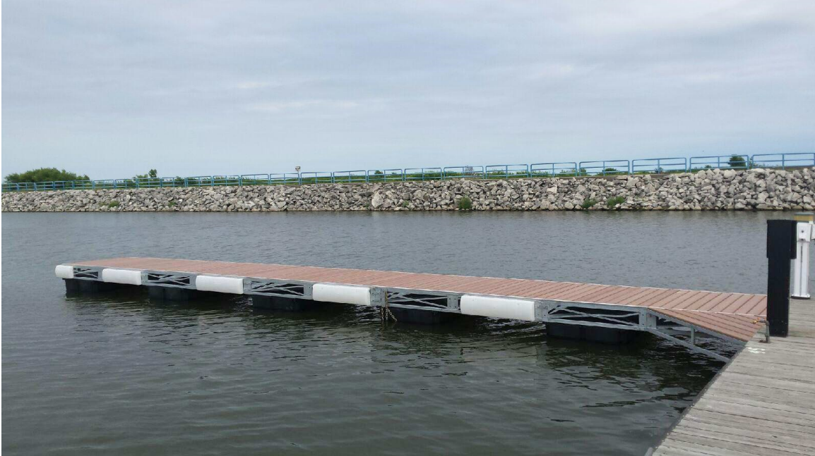
6x50 on Lake Michigan

no damage and much reduced bracing than most marina manufactures on the market that use 45 degree corners, and underwater trusses to add strength. We got asked to install a 50' finger with NO bracing, NO piling, just connected at the main, would it hold up, would it be stable they asked? Our answer? OF COURSE!