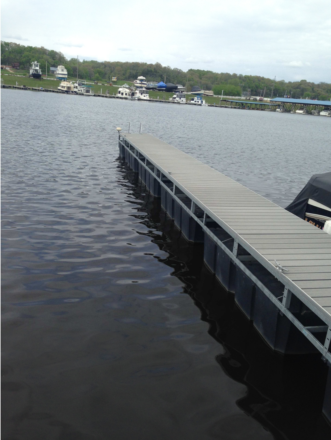
4x50 Mississippi River East Dubuque, IL

That last picture was taken 5 years AFTER it was installed! One of our design emphasis was having a dock that looked new year after year with no maintenance. That dock was froze in every year.