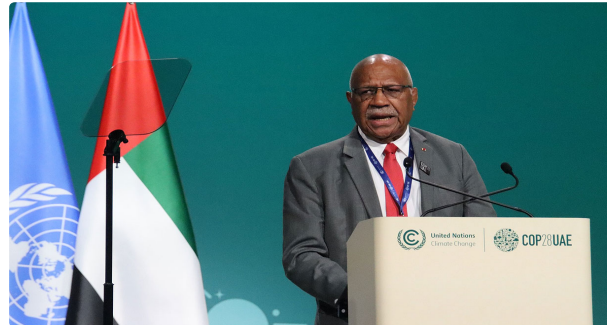
Prime Minister Sitiveni Rabuka

Rabuka says it is clear that we are at a breaking point for the survival of not only the Pacific but also of humanity.