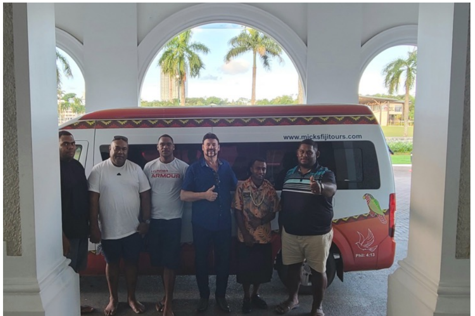
June 17, 2023 5:27 PM Edit 20230617_172738.jpg /Internal storage/DCIM/People shots w Rob