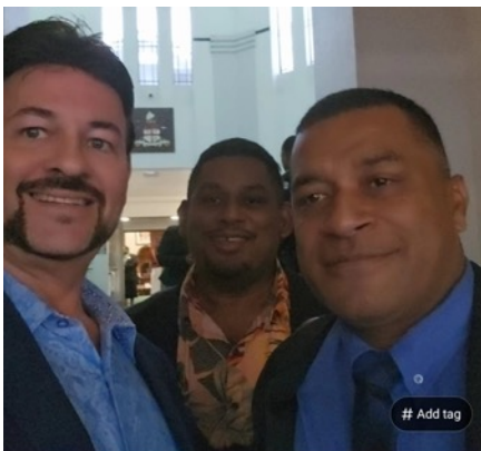
July 14, 2023 5:38 PM IMG-20230714-WA0018.jpg /Internal storage/DCIM/People shots w Rob