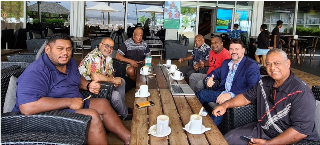
Meeting with the IPC Team and the Savu Savu Landowners where the Waste to Energy Plant will be built in Vanua Levu.