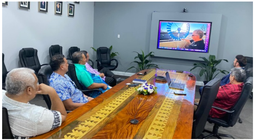
While in Cook, IPC's Team met with PM Rabuka from Fiji at the Pacific Islands Leaders Conference and attended two separate special events with him and the Fijian people of Cook Islands.