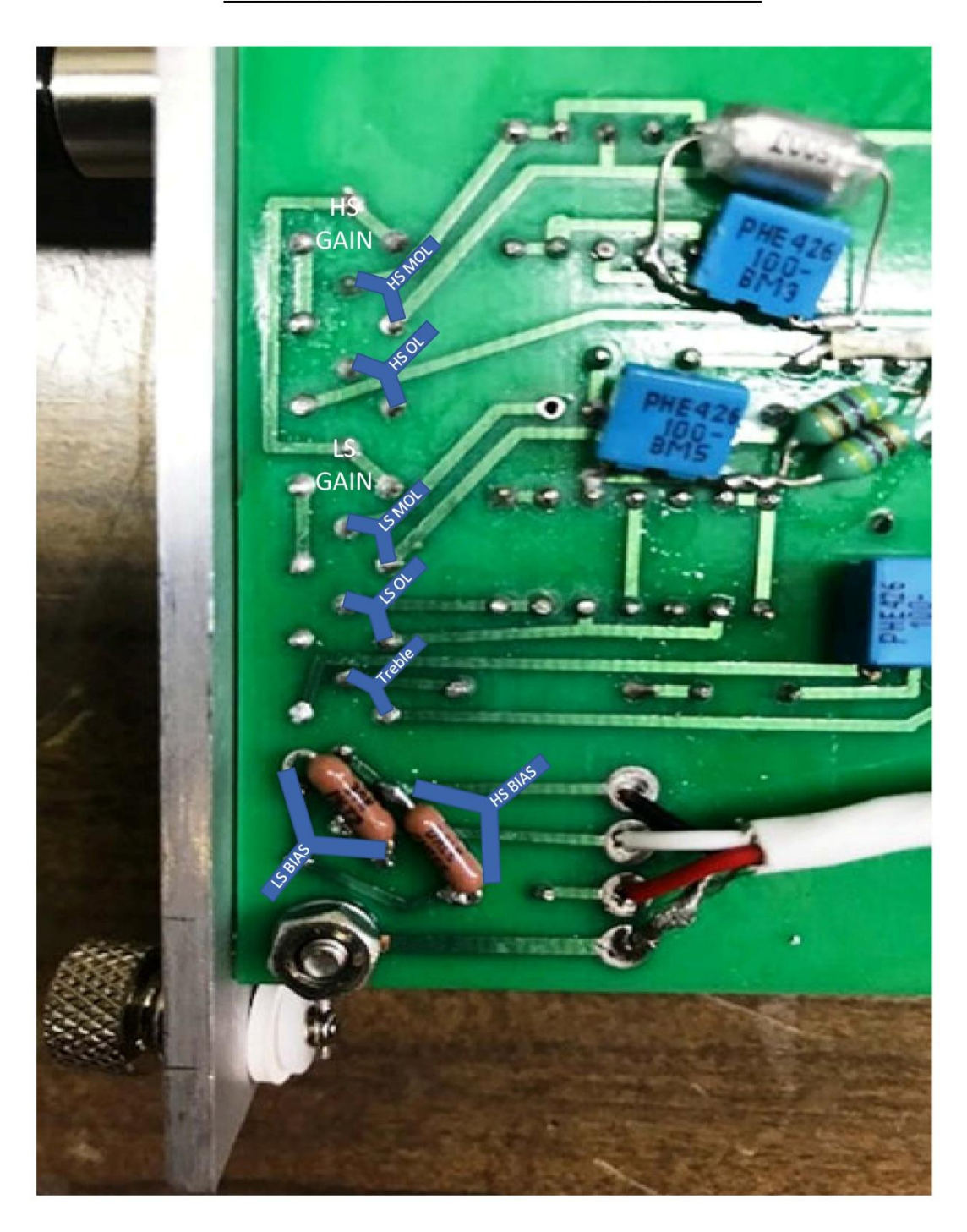
NextGen A80R/C Record Card: Back Side of Board