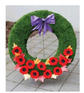
200524 #24 Wreath

Once again we respectfully request your consideration of either purchasing a wreath or making a Donation to the Poppy Fund. All proceeds will assure emergency assistance to ex-service personnel and their dependants during distress.