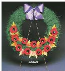
200524 # 24 Wreath

Once again we respectfully request your consideration of either purchasing a wreath or making a Donation to the Poppy Fund. All proceeds will assure emergency assistance to ex-service personnel and their dependants during distress.