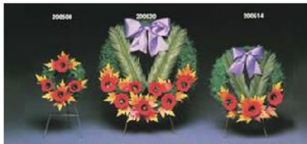
200508 # 08 Wreath 200520 # 20 Wreath 200514 # 14 Wreath