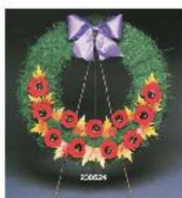
200524 # 24 Wreath

Once again we respectfully request your consideration of either purchasing a wreath or making a Donation to the Poppy Fund. All proceeds will assure emergency assistance to ex-service personnel and their dependants during distress.