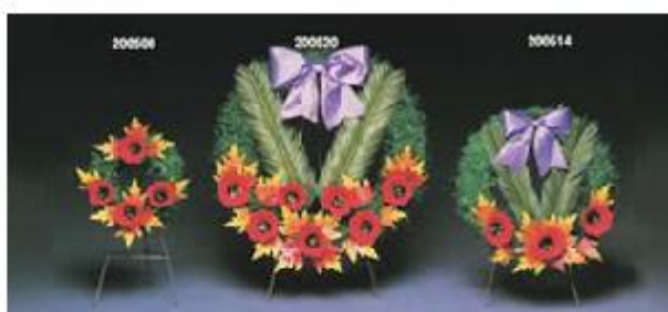
200508 # 08 Wreath 200520 # 20 Wreath 200514 # 14 Wreath