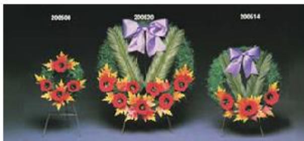
200508 # 08 Wreath 200520 # 20 Wreath 200514 # 14 Wreath