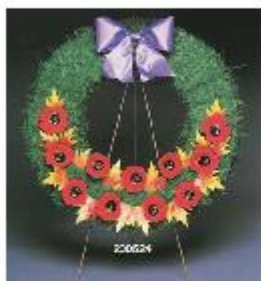
200524 # 24 Wreath

Once again we respectfully request your consideration of either purchasing a wreath or making a Donation to the Poppy Fund. All proceeds will assure emergency assistance to ex-service personnel and their dependants during distress.