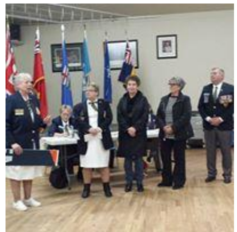
Ladies make donation of $30,000 to Renovation Fund