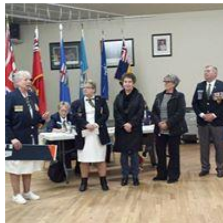
Ladies make donation of $30,000 to Renovation Fund

Thank you to all of you for your support of our annual Tea and Bake Sale.