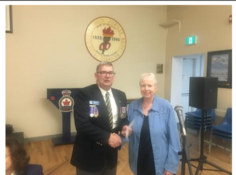
Ladies make donation to Legion