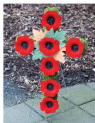
200535 #35 Cross