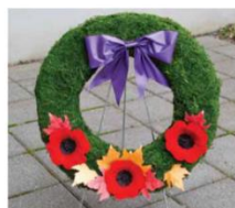
200514 #14 Wreath