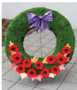
200524 #24 Wreath

Once again we respectfully request your consideration of either purchasing a wreath or making a Donation to the Poppy Fund. All proceeds will assure emergency assistance to ex-service personnel and their dependants during distress.