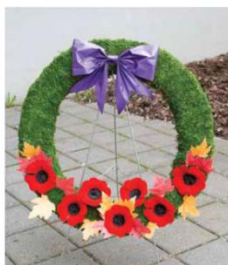
200520 #20 Wreath