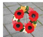
200508 #08 Wreath