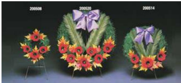
200508 # 08 Wreath 200520 # 20 Wreath 200514 # 14 Wreath