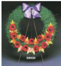
200524 # 24 Wreath

Once again we respectfully request your consideration of either purchasing a wreath or making a Donation to the Poppy Fund. All proceeds will assure emergency assistance to ex-service personnel and their dependants during distress.