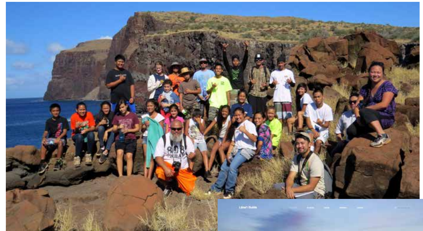
Lānaʻi High & Elementary School students at Kaunolū, with the famed Pali o Kāholo in the background.

We’ve also developed curricula and engaged Lānaʻi students in cultural literacy/place-based education programs and partnered with the majority landowner, Pūlama Lānaʻi, in access and