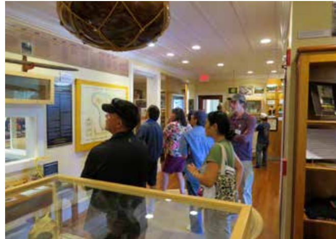
Guests from near and far explore island history at Lānaʻi Culture and Heritage Center.

The opening lines of an ancient mele (chant) describes Lānaʻi with the following line—“Hanohano Lānaʻi i ke kaunaʻoa, koku kapa ʻahuʻula kau poʻohiwi...” Lānaʻi is distinguished by the lei of kaunaʻoa ( Cuscuta sandwichiana ), which looks like a feather cloak set upon its shoulders.