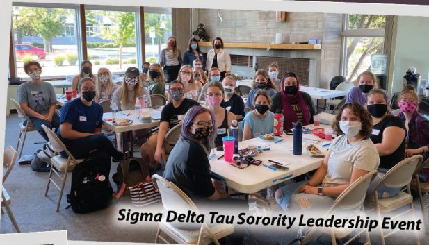
Sigma Delta Tau Sorority Leadership Event