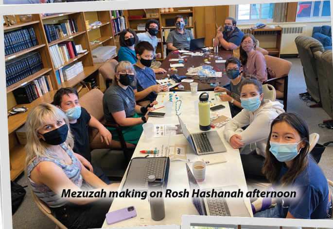
Mezuzah making on Rosh Hashanah afternoon