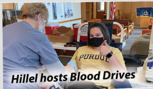
Hillel hosts Blood Drives