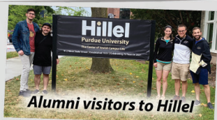
Alumni visitors to Hillel