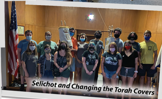
Selichot and Changing the Torah Covers