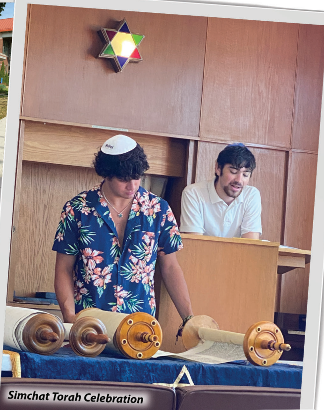
Simchat Torah Celebration