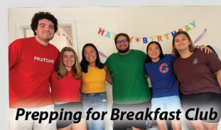
Prepping for Breakfast Club