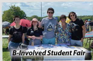
B-Involved Student Fair