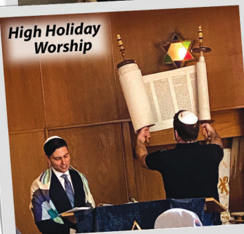
High Holiday Worship