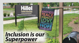
Inclusion is our Superpower