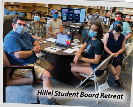
Hillel Student Board Retreat