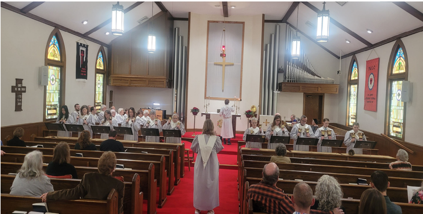
Handbells performed “Canon of Grace” for the Prelude at Sunday’s Worship Service.