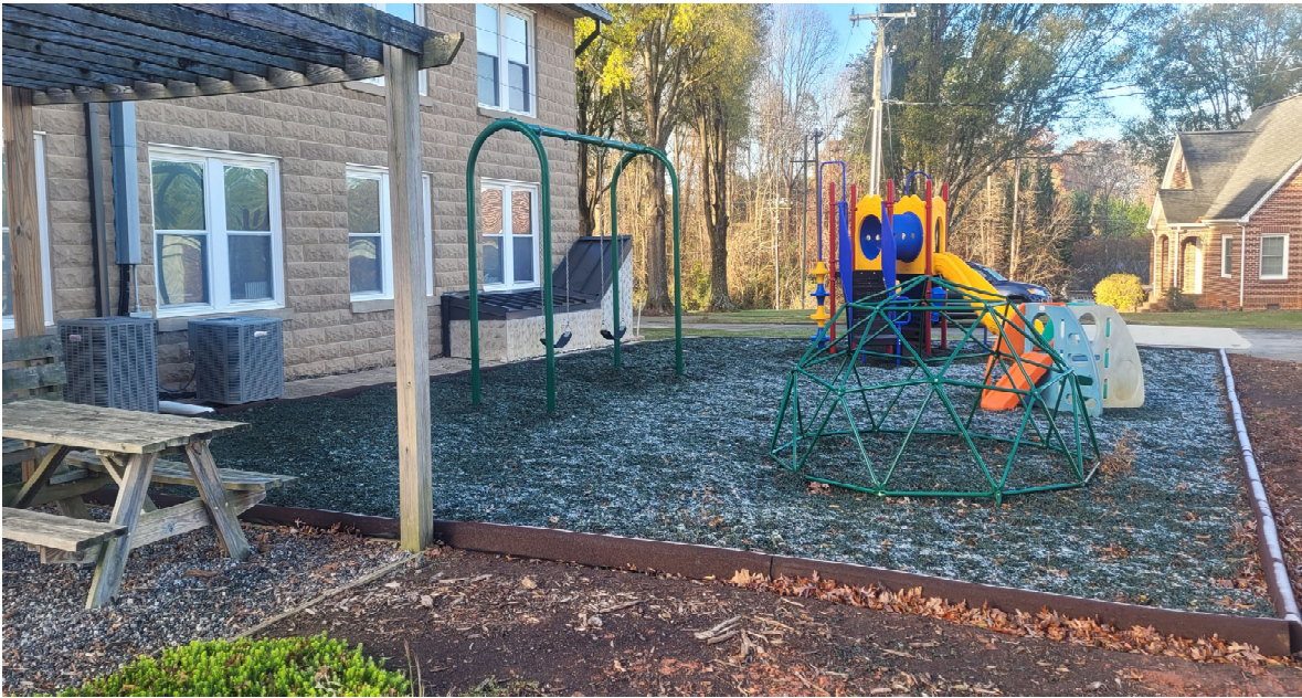
The new Playground

Thanks to all who helped with this pro- ject.