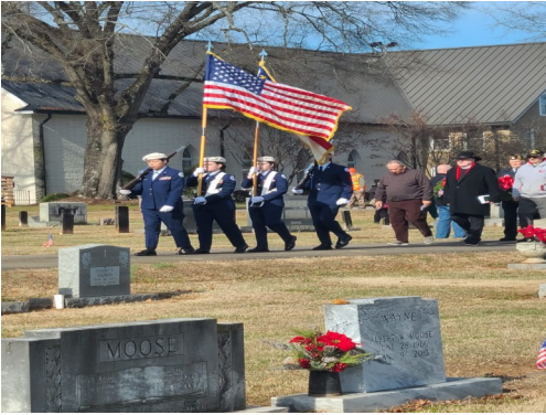
Maiden High School JROTC leads the procession into the graveyard.