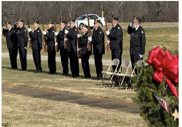
Gun salute performed by American Legion Post 16 Honor Guard.