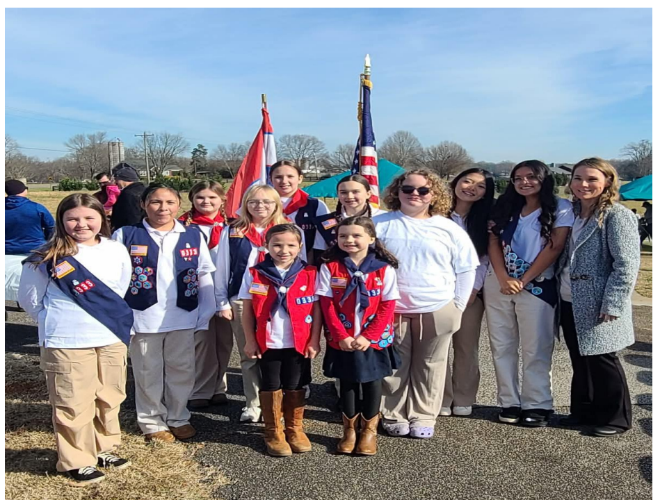
American Heritage Girls Troop 0333