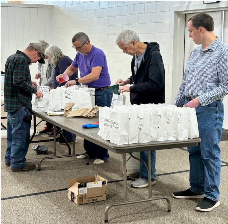
The Evangelism Committee put together luminaries for our Christmas Eve Service.