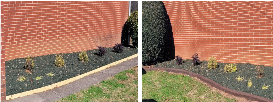
David Link replenished and replanted the flower beds around the Fellowship Building. David cleaned out the gutters around the church building.