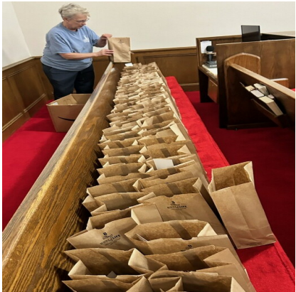
The Ladies' Group collected paper necessities for Western Carolina in December. They filled treat bags for church members at Christmas.