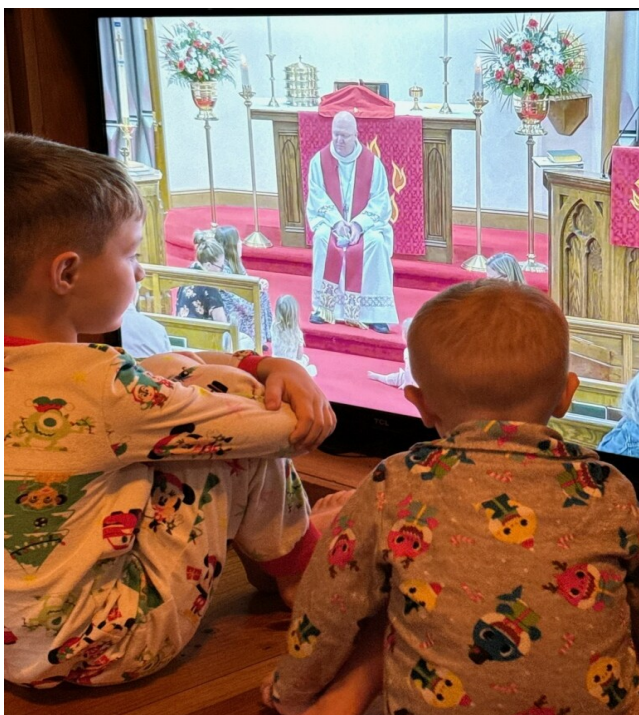
Can't get to church on Sunday? No problem === you can watch it on YouTube in your pajamas. The Crouch boys didn't have to miss Pastor' Children Sermon.