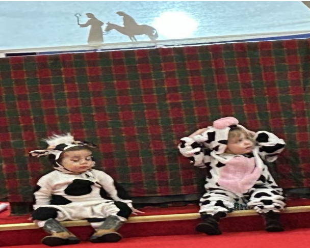
Children's Christmas Play