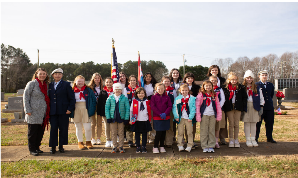
American Heritage Girls