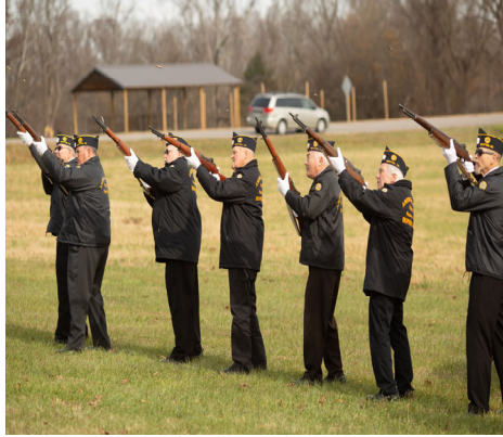
American Legion Post 16 Honor Guard