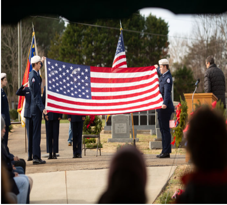
Presenting the Flag