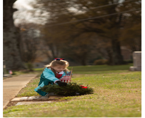
Laying of wreaths at graves