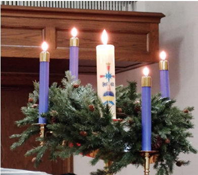
Christmas at St. James 2024