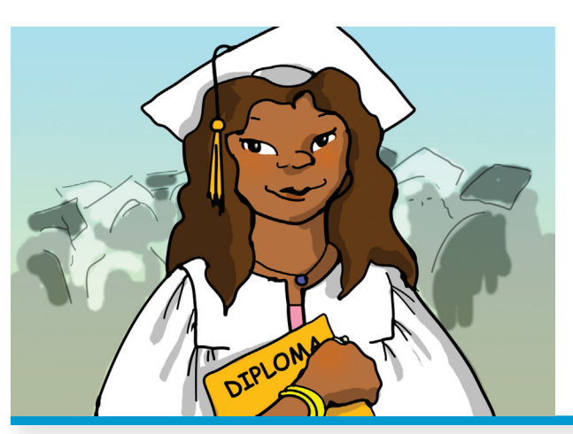
Money Smart for Young Adults page 19 of 47

The FAFSA (Free Application for Federal Student Aid) is the first step in the financial aid process. Use it to apply for federal student financial aid, such as the Pell grant, student loans, and college workstudy. Most states and schools use FAFSA information to award their financial aid.