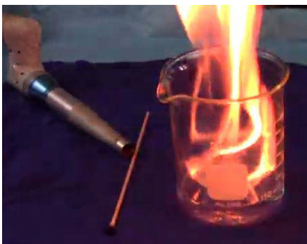
Flammable Liquids and Laser Ignition