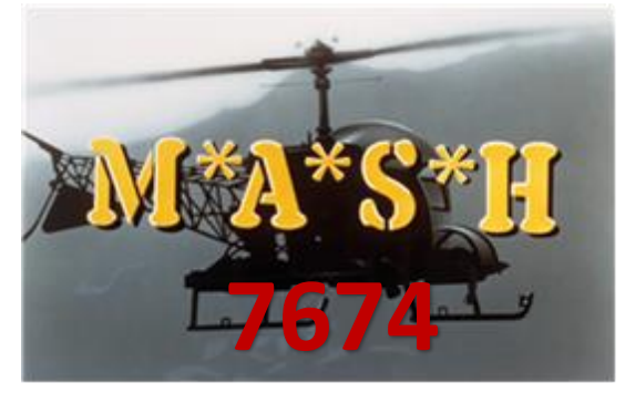
From "DOC" Goldstein, Post Surgeon

It is Spring and if you are active or do a lot of physical labor or if you are getting older and don't do a lot of physical activity, the chances are good that you may experience pain on your next workout. Pain happens for a variety of reasons.