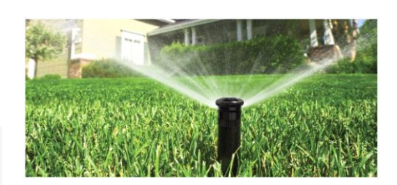
Don't slack on the water

Read on to find out how implementing these services now will benefit your future lawn!