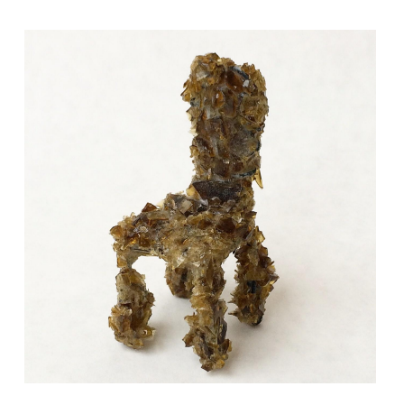
Keeping it Real!

Let how you act determine the way you feel. Don't let how you feel determine the way you act.