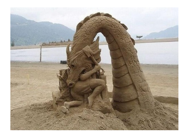
Just Keeping It Real!

In Evolutionary Enlightenment, Andrew Cohen redefines spiritual awakening for our contemporary world—a world characterized by exponential change and an ever-expanding appreciation for the processes of evolution. Through five tenets for living an enlightened life, Cohen will empower you to wholeheartedly participate in the process of change as your own spiritual practice. Evolutionary Enlightenment not only makes deep sense of life today; it will show you how to play an active role in shaping the world of tomorrow.