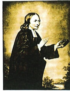
THE 'READING' PORTRAIT OF JOHN WESLEY From a miniature by David Allan (the painting by John Russell, 1841)

(830) 584-0300 office@hondo.church www.hondo.church