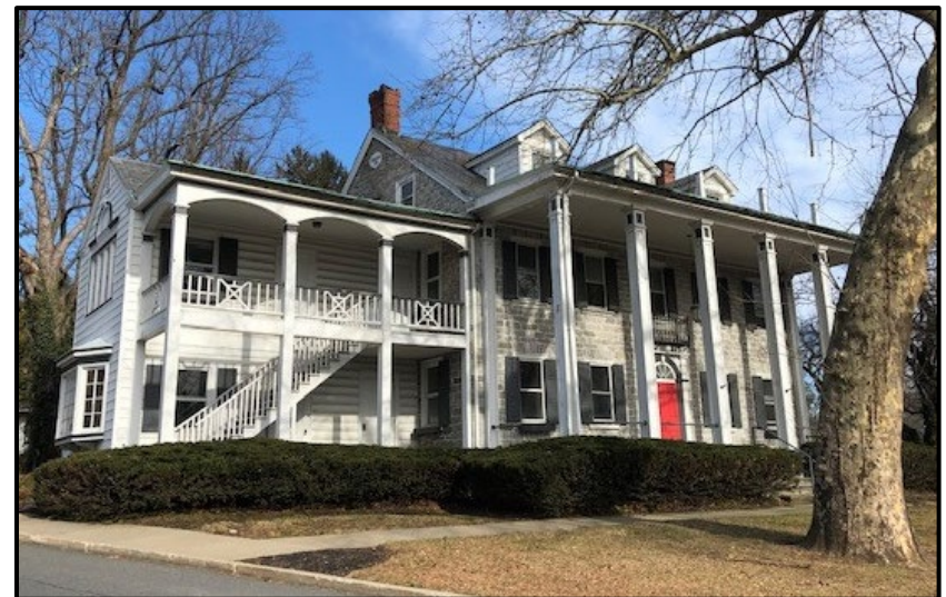
OASIS Community Center

This project is funded, in part, under a contract with the Northampton County Department of Human Services through funds provided by the County of Northampton and the Commonwealth of Pennsylvania.