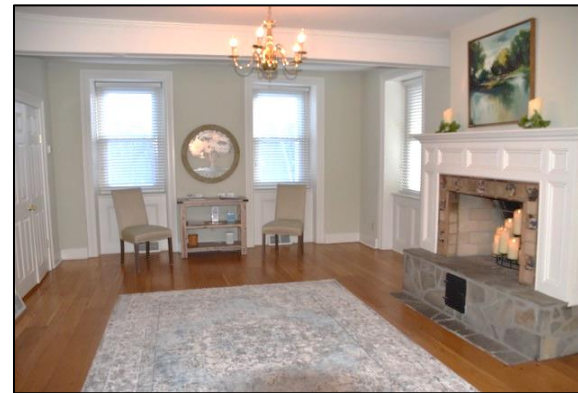
Our gathering room is used for yoga classes, meetings, and social events.