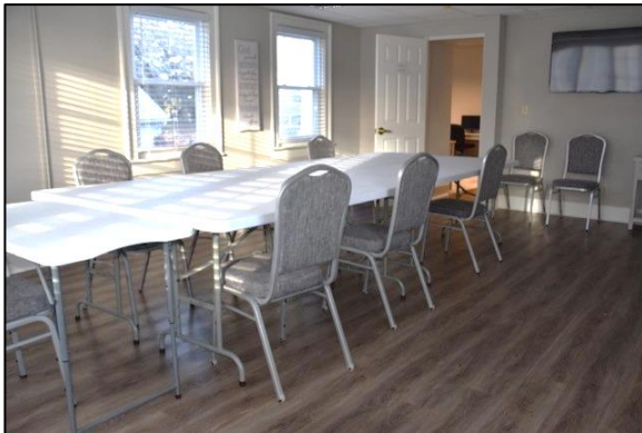
Our studio room accommodates larger meetings and workshops.

Visit OasisBethlehem.org/Calendar page for complete meeting information.