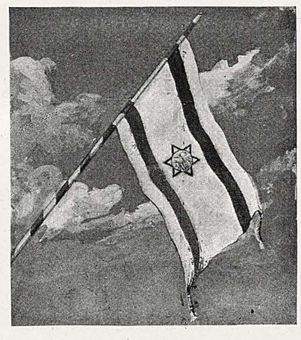
THE ZIONIST FLAG.

The results of the congress—who can accurately foresee at this early hour? We may, howbeit, confidently declare that a tremendous uplift has been given to the cause by the second Zionist congress. For one thing, Zionism has resolved that the immigration of foreign Jews into Palestine shall not be abetted or countenanced as long as the restrictive and prohibitive laws be not repealed from the statute-