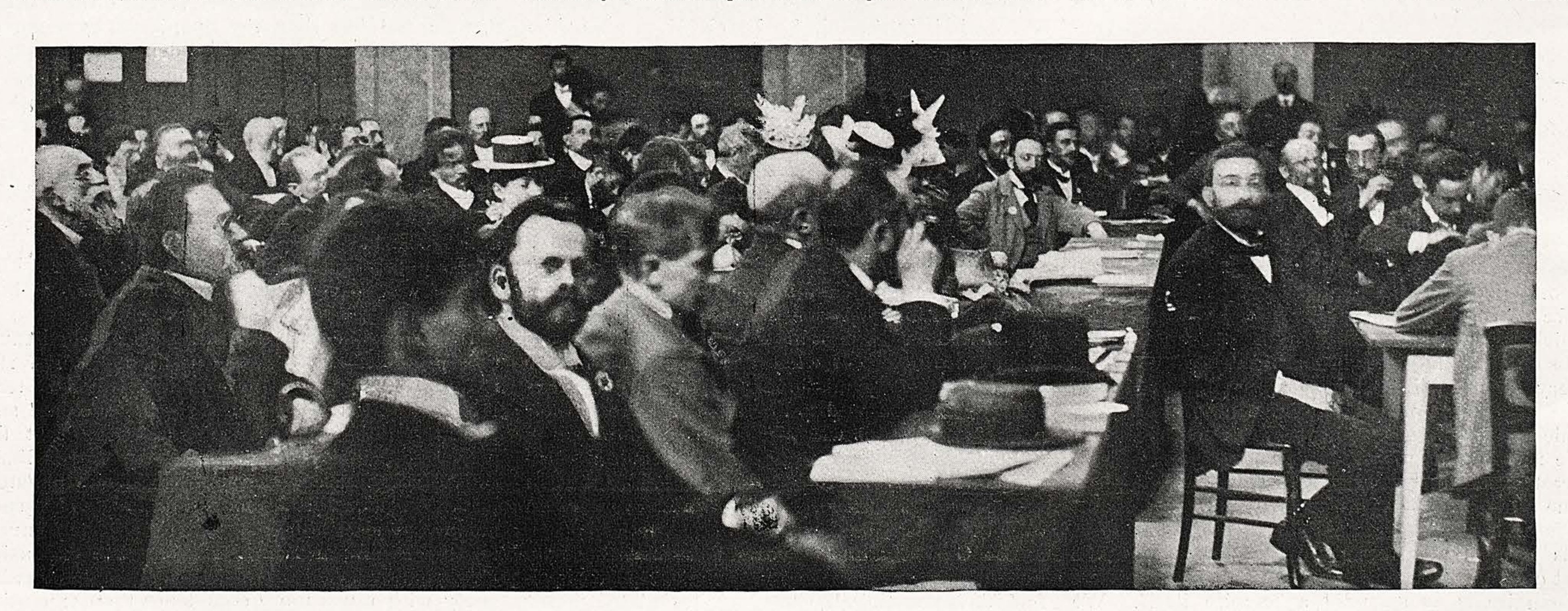
GROUP OF DELEGATES AT THE ZIONIST CONGRESS, BASLE.

On the Sabbath morning the stately synagogue of the town became the Mecca of the visitors. Favored, blessed shrine! Since last the pilgrims of Jerusalem offered up their prayers in the Temple of the Most High, no altar had sheltered such a body of worshippers, come together literally from the four corners of the earth. What rapt devotion! What tearful entreaty! What fervent thanksgiving! Within these walls there reigned no confusion of tongues, for the speech of the prophets and the sweet singers in Israel lived again. How these hosts thundered the thirty-seventh chapter of the Prophet Ezekiel, which rose in reverence as Herzl mounted the altar steps and