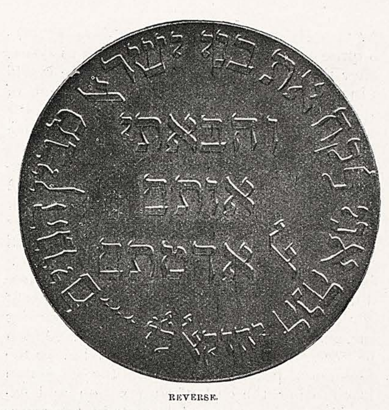
COMMEMORATIVE MEDAL OF THE SECOND ZIONIST CONGRESS. "Behold, I will take the children of Israel from among the nations, . . . and bring them into their own land."

happy Jewish dwellers (citizens they are not) in Russia, Roumania, and Galicia alone, whom only the promise of release from persecution can save from the slough of abject despond by pointing comfortingly and encouragingly to the well-beloved home of their forebears.