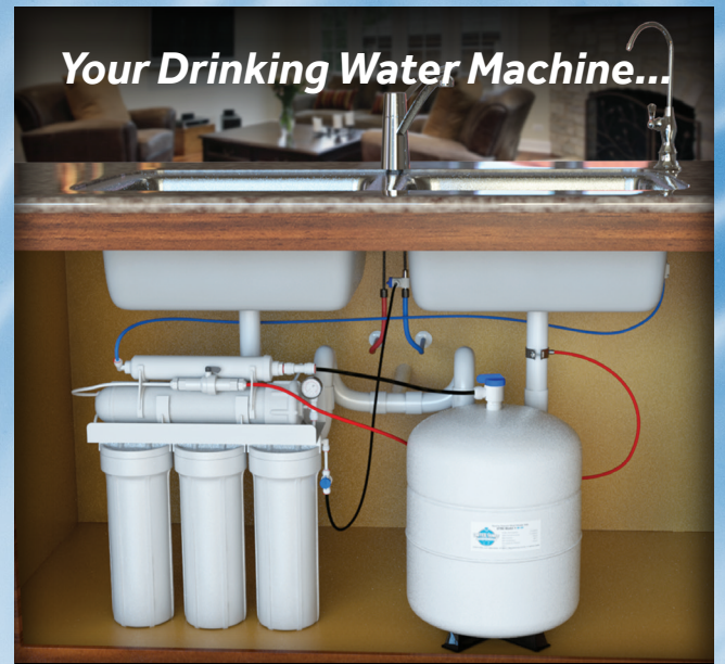
Your Drinking Water Machine...