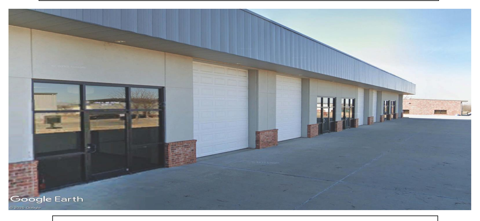
This is 1 of 5 buildings in the new Olivas Business Park. The location offers excellent access to I-35 and I-40. Additionally, these properties are convenient to Tinker AFB (3 miles), downtown OKC (7 miles), and OU Medical Center (5.5 miles).