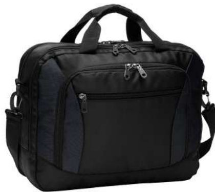
PORT AUTHORITY Commuter Brief BG307 1 color