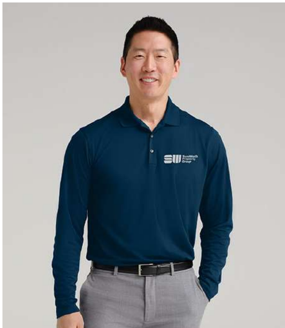
NIKE Dri-FIT Micro Pique 2.0 Long Sleeve Polo NKDC2104 Adult Sizes: XS-4XL | 7 colors