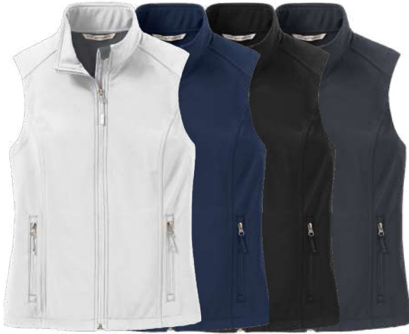
PORT AUTHORITY Ladies Core Soft Shell Vest L325 Women's Sizes: XS-4XL | 5 colors