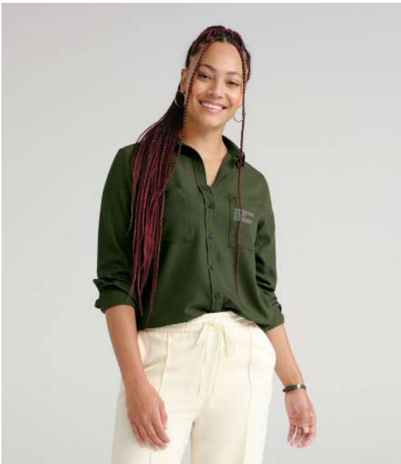
MERCER + METTLE Women's Stretch Crepe Long Sleeve Camp Blouse MM2013 Women's Sizes: XS-4XL | 4 colors