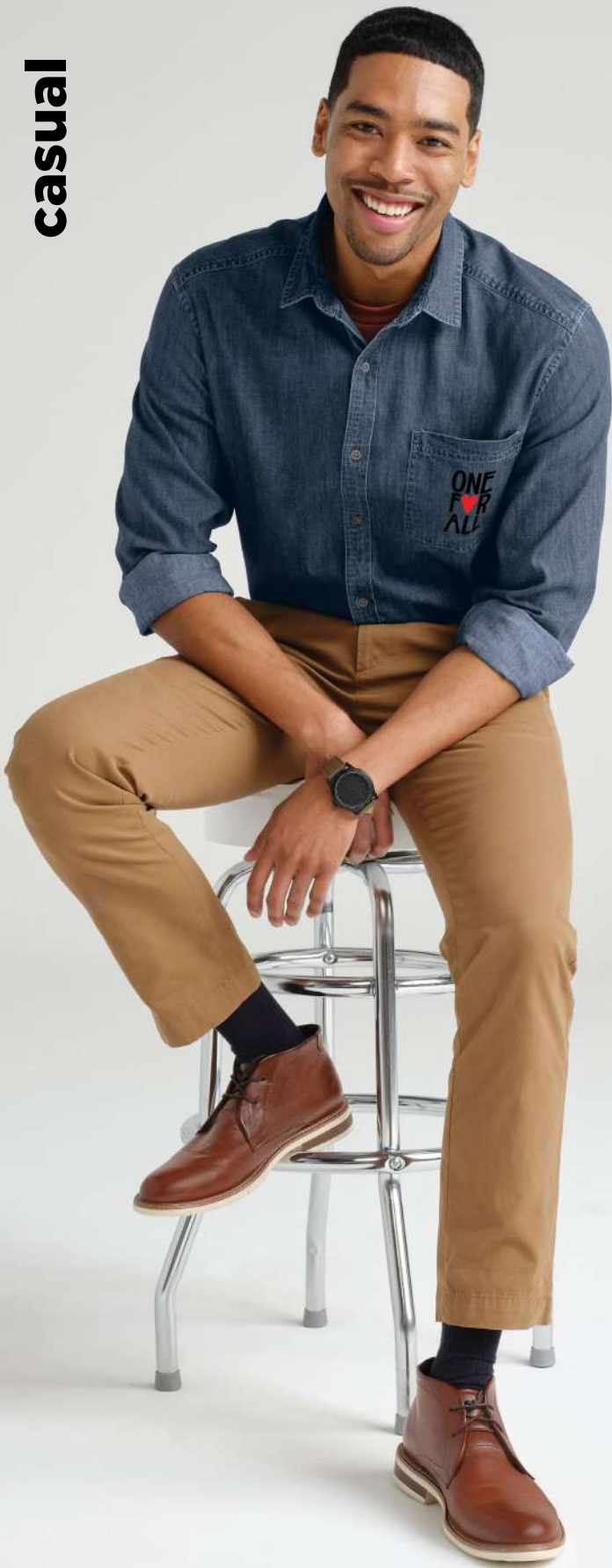
PORT AUTHORITY Long Sleeve Perfect Denim Shirt W676 Adult Sizes: XS-4XL | 2 colors