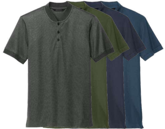
MERCER + METTLE Stretch Pique Henley MM1008 Adult Sizes: XS-4XL | 7 colors