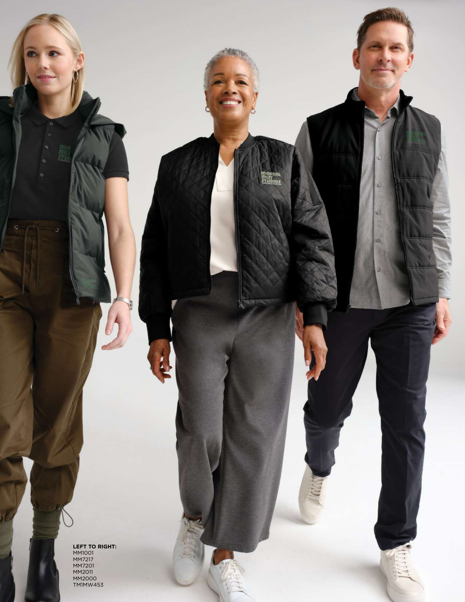
LEFT TO RIGHT: MM1001 MM7217 MM7201 MM2011 MM2000 TMIMW453