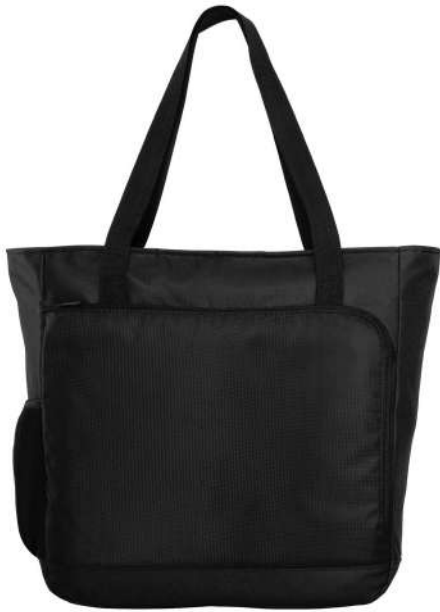
PORT AUTHORITY City Tote BG422 1 color