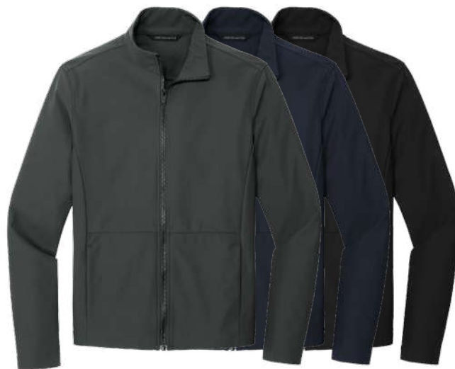
MERCER + METTLE Faille Soft Shell MM7100 Adult Sizes: XS-4XL | 3 colors