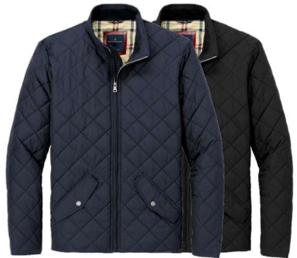
BROOKS BROTHERS Quilted Jacket BB18600 Adult Sizes: XS-4XL | 2 colors