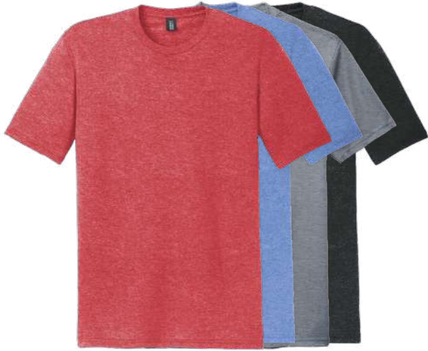
DISTRICT Perfect Tri Tee DM130 Adult Sizes: XS-4XL | 35 colors