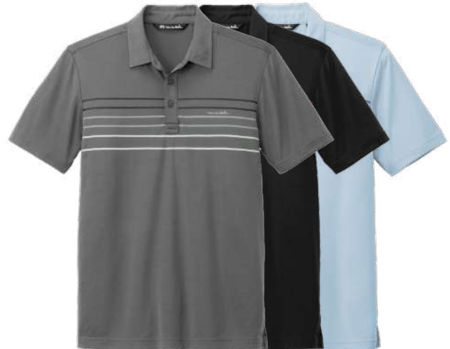
TRAVISMATHEW Coto Performance Chest Stripe Polo TM1MY400 Adult Sizes: S-3XL | 3 colors