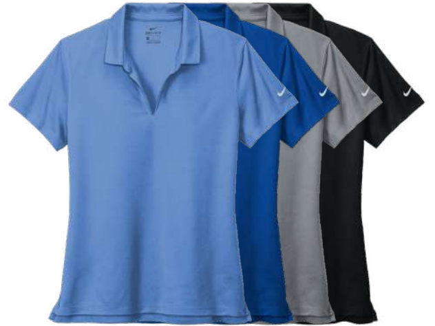
NIKE Ladies Dri-FIT Micro Pique 2.0 Polo NKDC1991 Women's Sizes: S-2XL | 20 colors