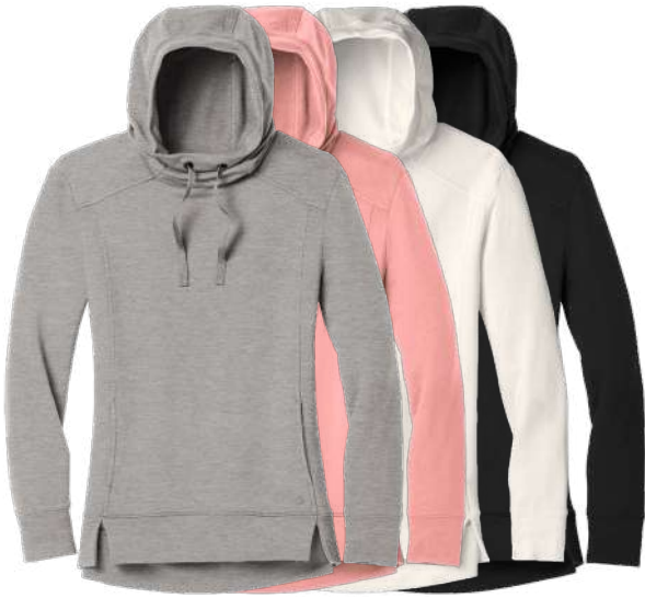
OGIO Ladies Luuma Pullover Fleece Hoodie LOG810 Women's Sizes: XS-4XL | 4 colors