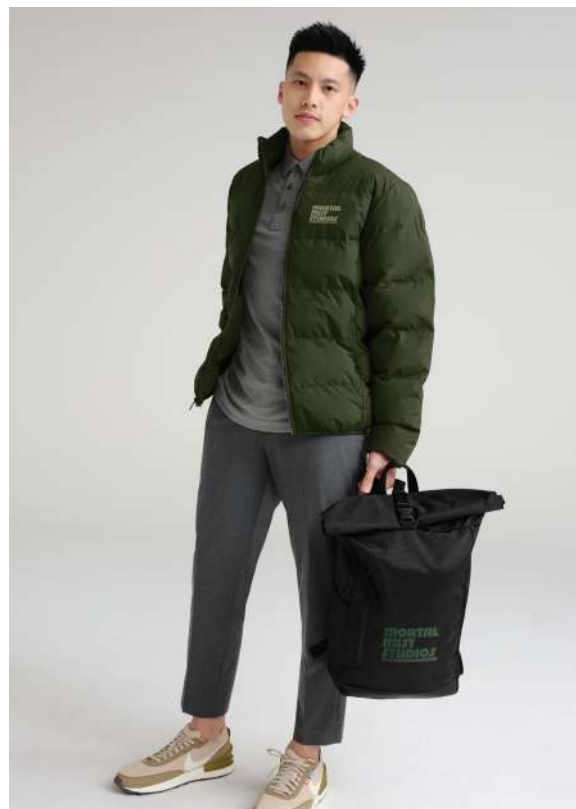
MERCER + METTLE Rucksack MMB201 One Size Fits All | 1 color Worn with TM1MU412, MM7210