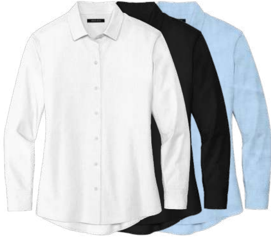
MERCER + METTLE Women's Long Sleeve Stretch Woven Shirt MM2001 Women's Sizes: XS-4XL | 4 colors