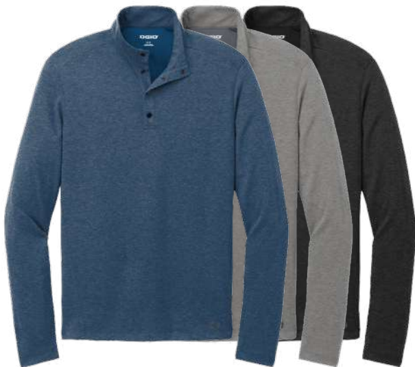
OGIO Command 1/4-Snap OG151 Adult Sizes: XS-4XL | 3 colors