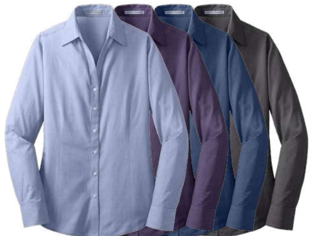
PORT AUTHORITY Ladies Crosshatch Easy Care Shirt L640 Women's Sizes: XS-4XL | 4 colors