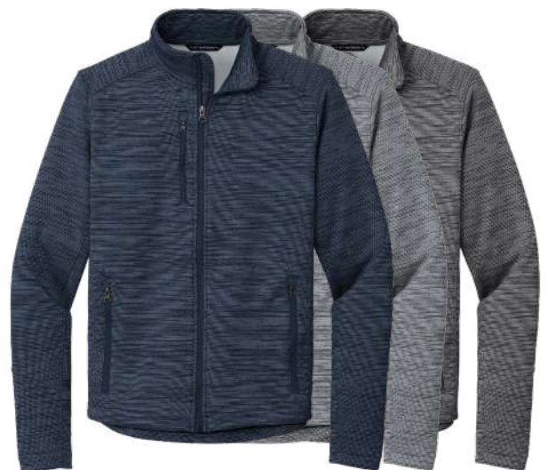
PORT AUTHORITY Digi Stripe Fleece Jacket F231 Adult Sizes: XS-4XL | 3 colors