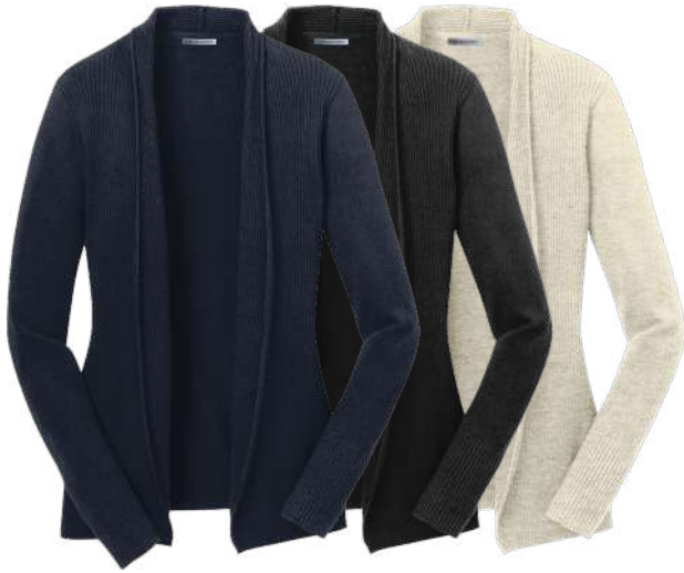
PORT AUTHORITY Ladies Open Front Cardigan Sweater LSW289 Women's Sizes: XS-4XL | 4 colors