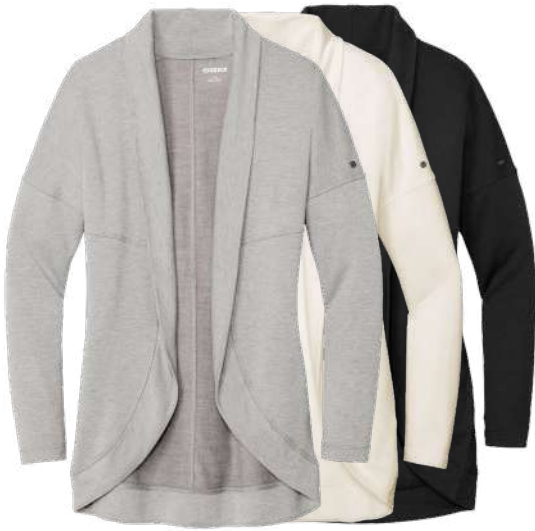
OGIO Ladies Luuma Coccoon Fleece LOG811 Women's Sizes: XS-4XL | 3 colors