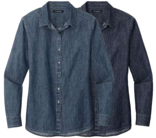
PORT AUTHORITY Ladies Long Sleeve Perfect Denim Shirt LW676 Women's Sizes: XS-4XL | 2 colors