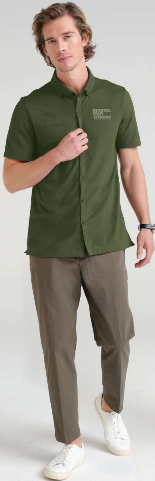
MERCER + METTLE Stretch Pique Full-Button Polo MM1006 Adult Sizes: XS-4XL | 7 colors