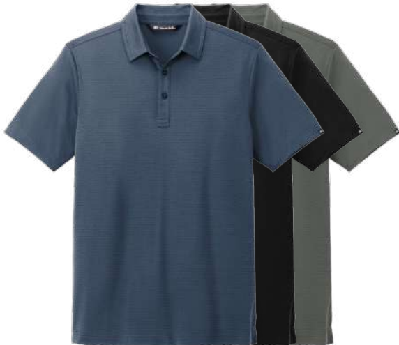
TRAVISMATHEW Bayfront Solid Polo TM1MY399 Adult Sizes: S-3XL | 4 colors