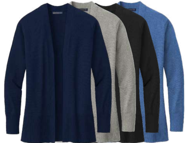
BROOKS BROTHERS Women's Cotton Stretch Long Cardigan Sweater BB18403 Women's Sizes: XS-4XL | 4 colors