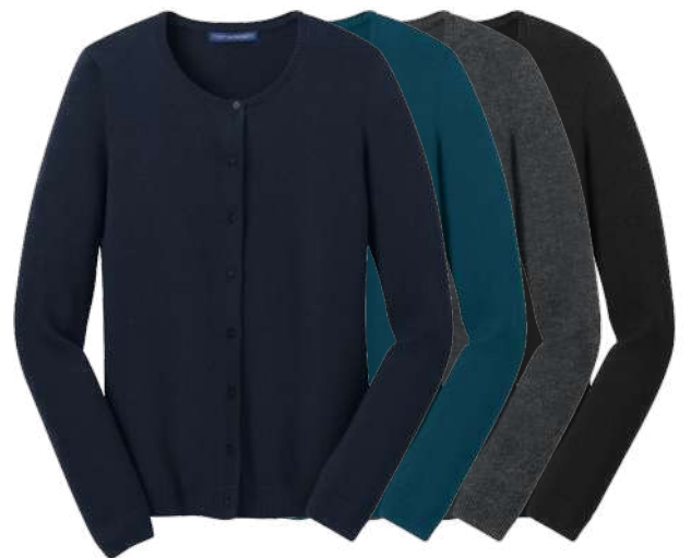
PORT AUTHORITY Ladies Cardigan Sweater LSW287 Women's Sizes: XS-4XL | 3 colors