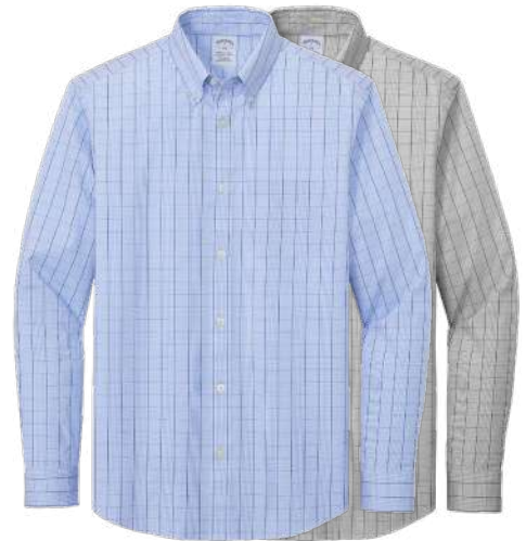
BROOKS BROTHERS Wrinkle Free Stretch Patterned Shirt BB18008 Adult Sizes: XS-4XL | 2 colors

Buttoned-up should not mean boring. A true classic look brings the team together with a sense of professionalism and pride.