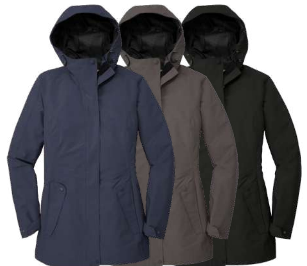
PORT AUTHORITY Ladies Collective Outer Shell Jacket L900 Women's Sizes: XS-4XL | 4 colors