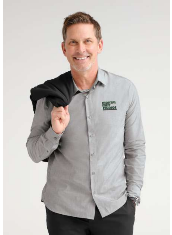
MERCER + METTLE Long Sleeve Stretch Woven Shirt MM2000 Adult Sizes: XS-4XL | 7 colors Worn with TM1MW453