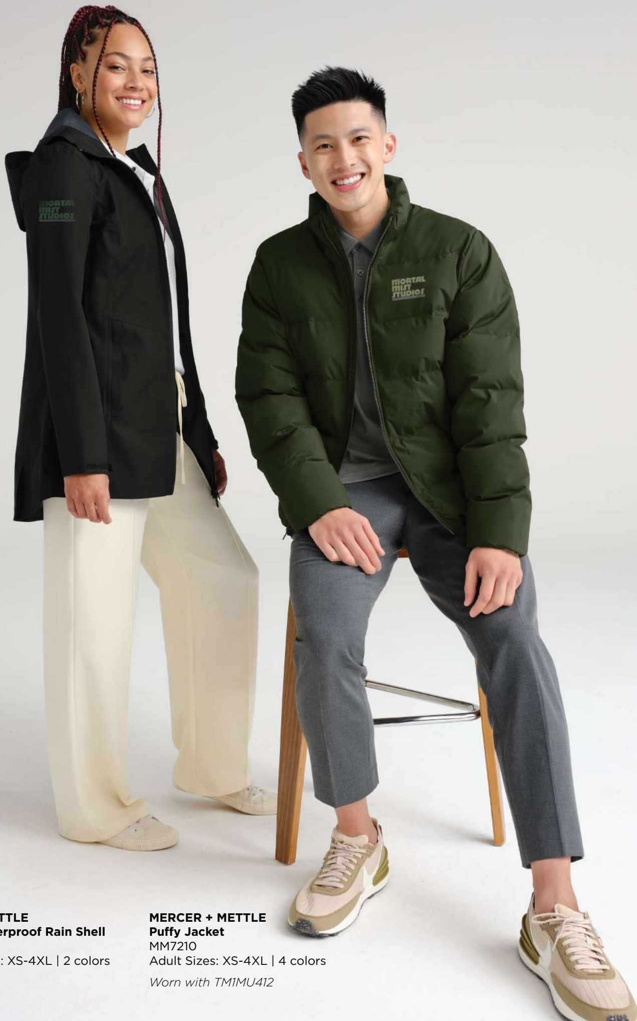
MERCER + METTLE Women's Waterproof Rain Shell MM7001 Women's Sizes: XS-4XL | 2 colors