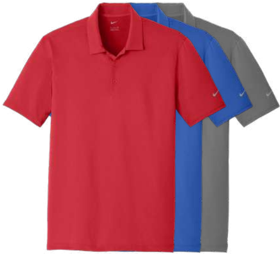
NIKE Dri-FIT Legacy Polo 883681 Adult Sizes: XS-4XL | 6 colors