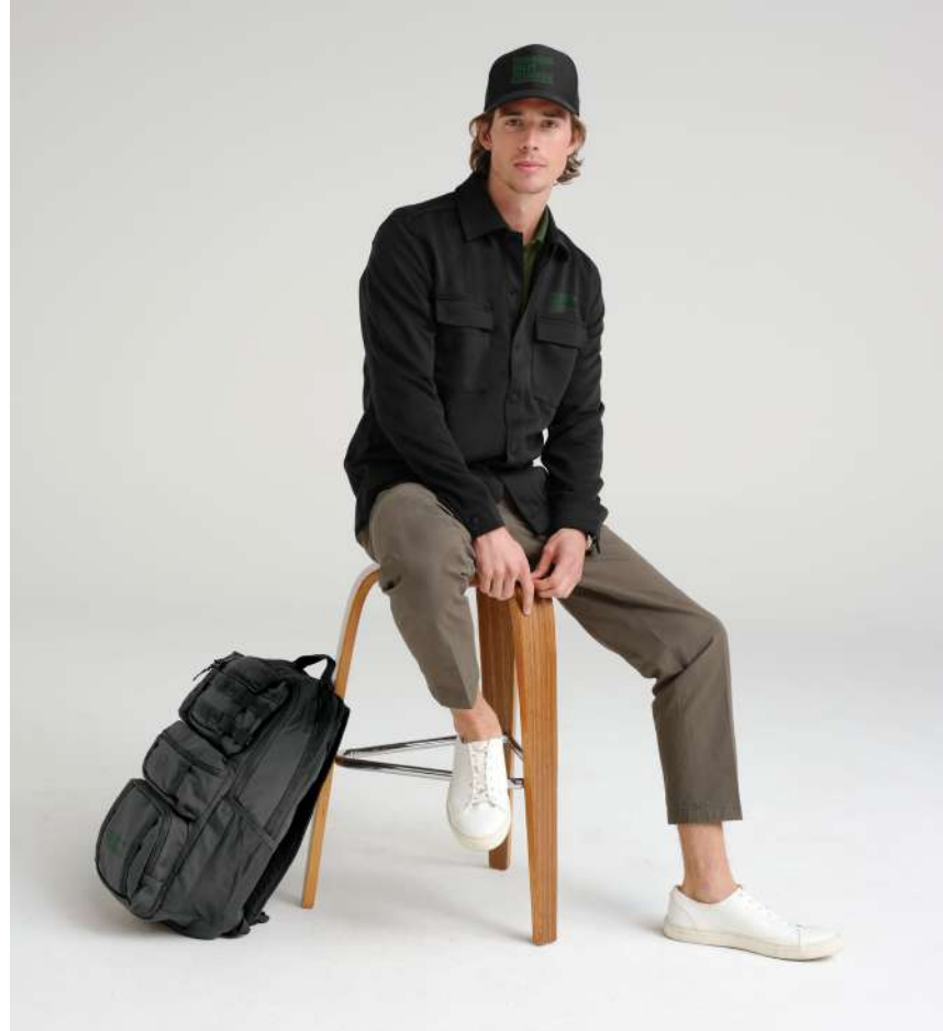
OGIO Utilitarian Modular Pack 91018 2 colors