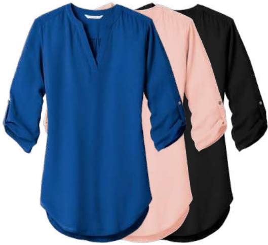
PORT AUTHORITY Ladies 3/4-Sleeve Tunic Blouse LW701 Women's Sizes: XS-4XL | 8 colors

Uplift the whole team with outfits that speak to a cohesive vision, a laid-back attitude and a clear focus on accomplishing great work together.