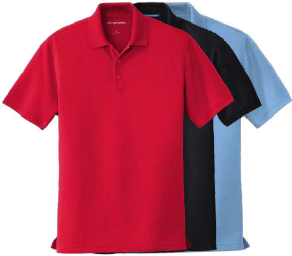
PORT AUTHORITY Dry Zone UV Micro-Mesh Polo K110 Adult Sizes: XS-6XL | 16 colors