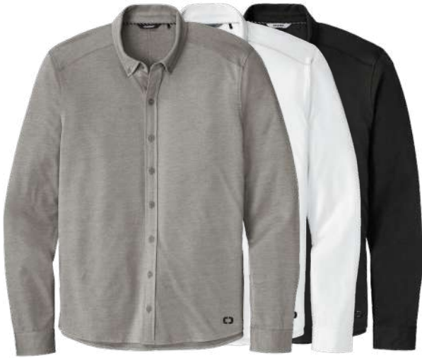
OGIO Code Stretch Long Sleeve Button-Up OG145 Adult Sizes: XS-4XL | 3 colors