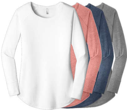
DISTRICT Women's Perfect Tri Long Sleeve Tunic Tee DT132L Women's Sizes: XS-4XL | 5 colors

Uplift the whole team with outfits that speak to a cohesive vision, a laid-back attitude and a clear focus on accomplishing great work together.