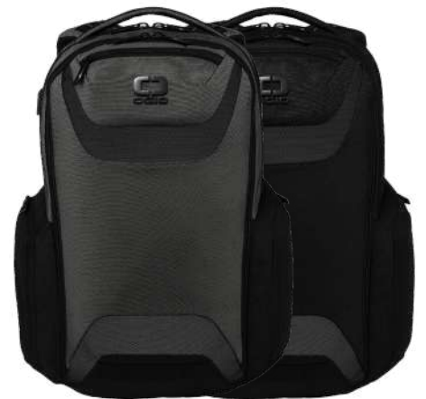
OGIO Connected Pack 91008 2 colors