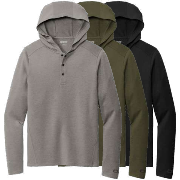
OGIO Luuma Flex Hooded Henley OG826 Adult Sizes: XS-4XL | 3 colors