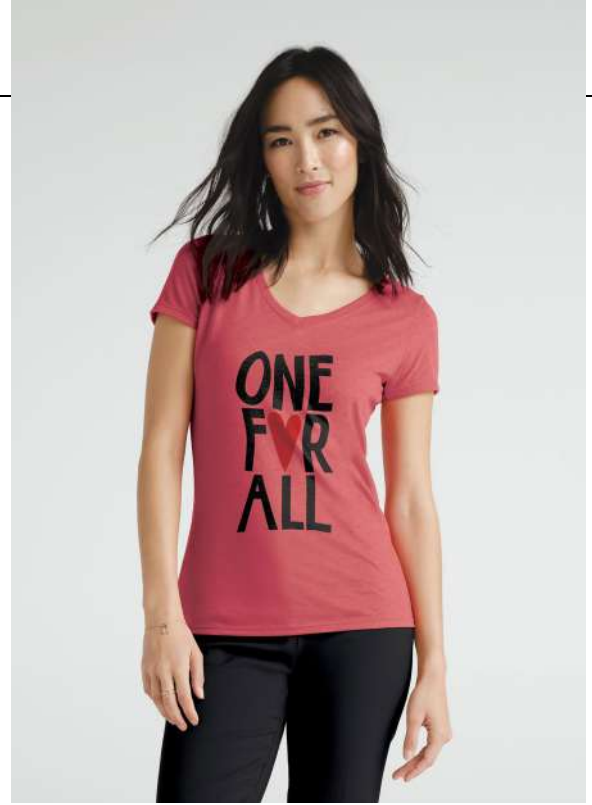
DISTRICT Women's Perfect Tri V-Neck Tee DM1350L Women's Sizes: XS-4XL | 23 colors