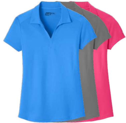
NIKE Ladies Dri-FIT Legacy Polo 838957 Women's Sizes: XS-2XL | 6 colors