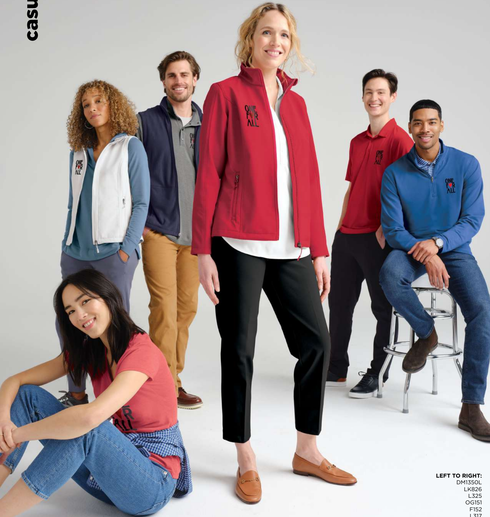
LEFT TO RIGHT: DM1350L LK826 L325 OG151 F152 L317 LW680 883681 K825 W680