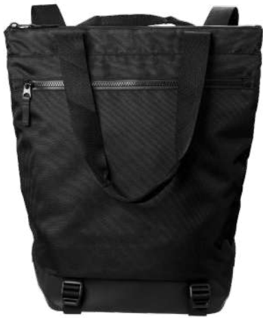
MERCER + METTLE Convertible Tote MMB202 1 color