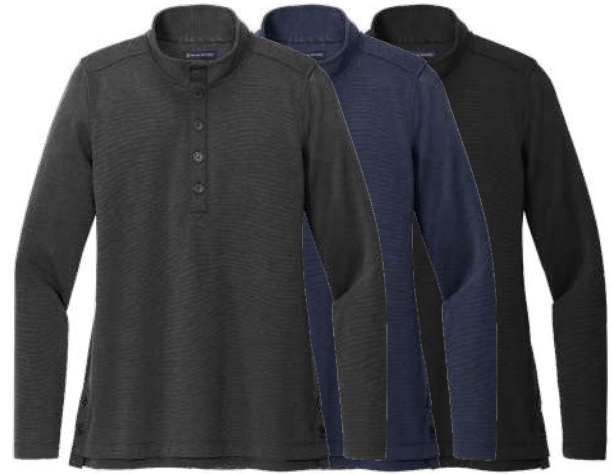
BROOKS BROTHERS Women's Mid-Layer Stretch 1/2 Button BB18203 Women's Sizes: XS-4XL | 3 colors