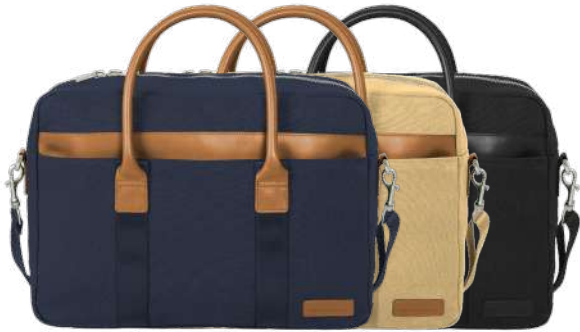
BROOKS BROTHERS Wells Briefcase BB18830 3 colors