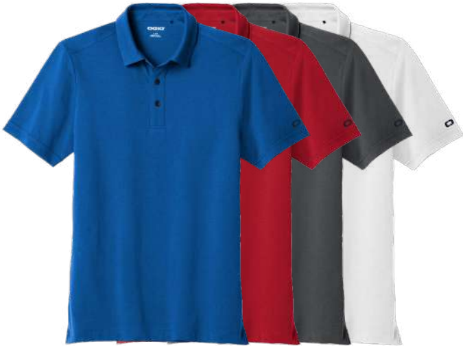
OGIO Limit Polo OG138 Adult Sizes: XS-4XL | 6 colors