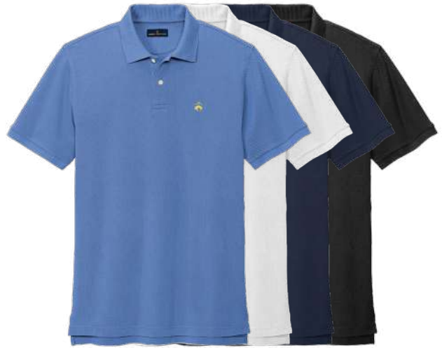
BROOKS BROTHERS Pima Cotton Pique Polo BB18200 Adult Sizes: XS-4XL | 6 colors