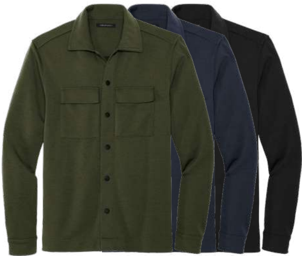
MERCER + METTLE Double-Knit Snap Front Jacket MM3004 Adult Sizes: XS-4XL | 3 colors