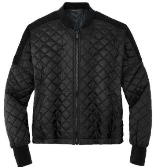
MERCER + METTLE Women's Boxy Quilted Jacket MM7201 Women's Sizes: XS-4XL | 1 color