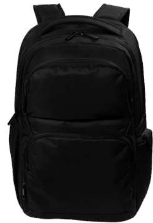
PORT AUTHORITY Transit Backpack BG224 1 color