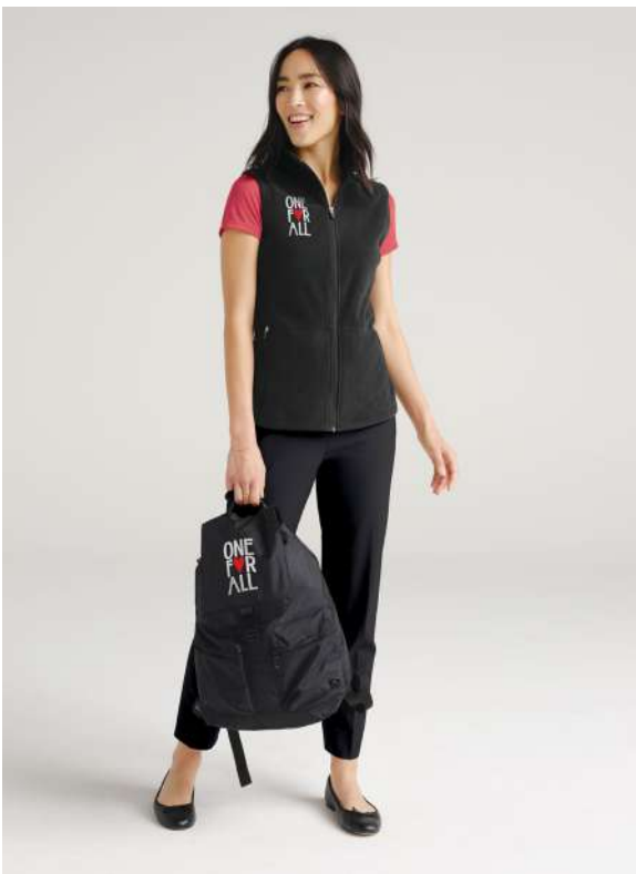
OGIO Evolution Pack 91015 4 colors