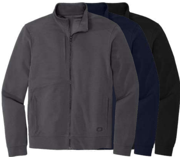
OGIO Hinge Full-Zip OG820 Adult Sizes: XS-4XL | 3 colors