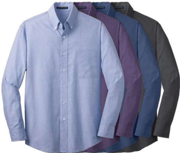
PORT AUTHORITY Crosshatch Easy Care Shirt S640 Adult Sizes: XS-4XL | 4 colors