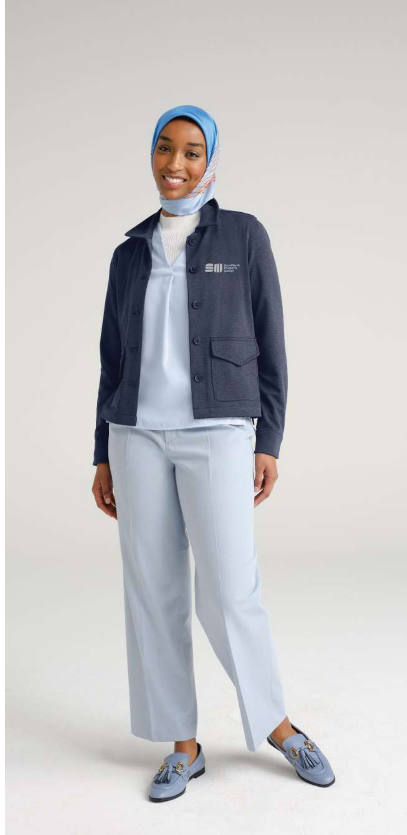
BROOKS BROTHERS Women's Mid-Layer Stretch Button Jacket BB18205 Women's Sizes: XS-4XL | 3 colors Worn with BB18009