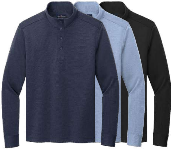
BROOKS BROTHERS Mid-Layer Stretch 1/2 Button BB18202 Adult Sizes: XS-4XL | 5 colors