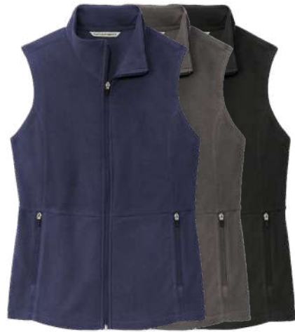
PORT AUTHORITY Ladies Accord Microfleece Vest L152 Women's Sizes: XS-4XL | 3 colors