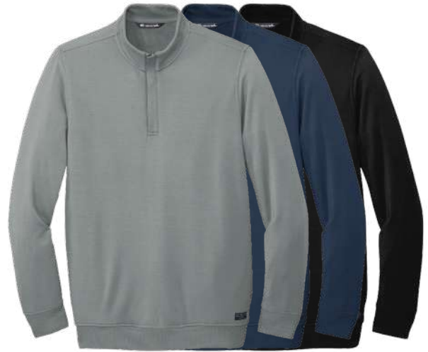
TRAVISMATHEW Newport 1/4-Zip Fleece TM1MU419 Adult Sizes: S-3XL | 3 colors