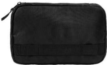
MERCER + METTLE Utility Case MMB700 1 color