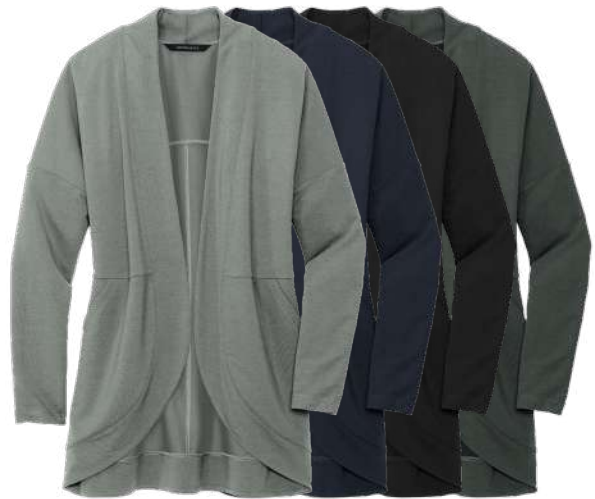
MERCER + METTLE Women's Stretch Open-Front Cardigan MM3015 Women's Sizes: XS-4XL | 4 colors