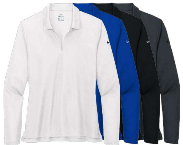
NIKE Ladies Dri-FIT Micro Pique 2.0 Long Sleeve Polo NKDC2105 Women's Sizes: S-2XL | 7 colors