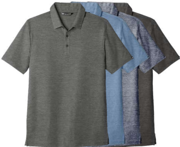
TRAVISMATHEW Oceanside Heather Polo TM1MU412 Adult Sizes: S-3XL | 8 colors