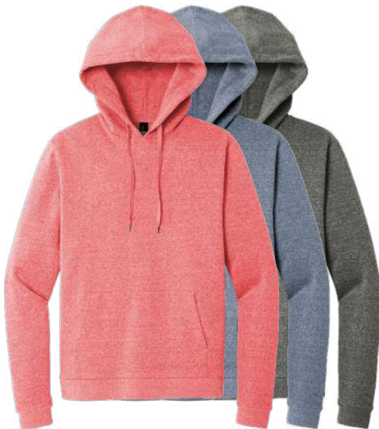
DISTRICT Perfect Tri Fleece Pullover Hoodie DT1300 Adult Sizes: XS-4XL | 12 colors