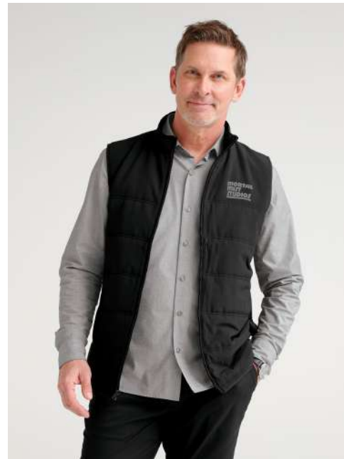
TRAVIS MATHEW Cold Bay Vest TM1MW453 Adult Sizes: S-3XL | 2 colors Worn with MM2000