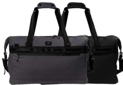
OGIO Commuter Duffel 411098 2 colors