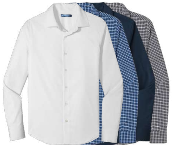
PORT AUTHORITY City Stretch Shirt W680 Adult Sizes: XS-4XL | 5 colors