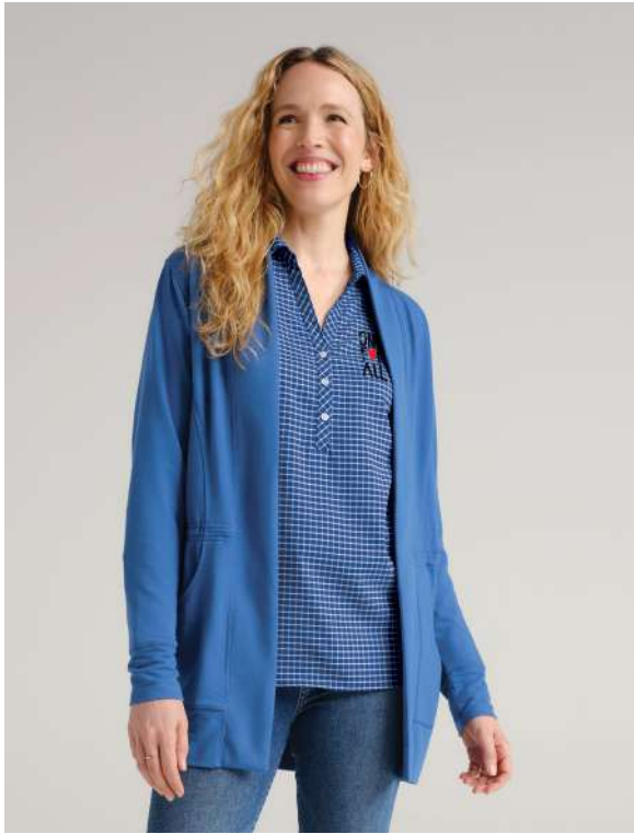
PORT AUTHORITY Ladies Microterry Cardigan LK825 Women's Sizes: XS-4XL | 4 colors Worn with LW680