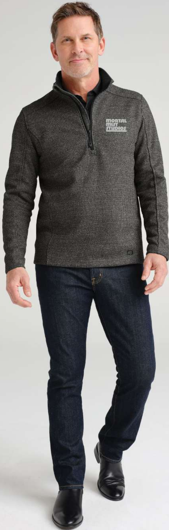
OGIO Grit Fleece 1/2-Zip OG729 Adult Sizes: XS-4XL | 2 colors Worn with TM1MY399