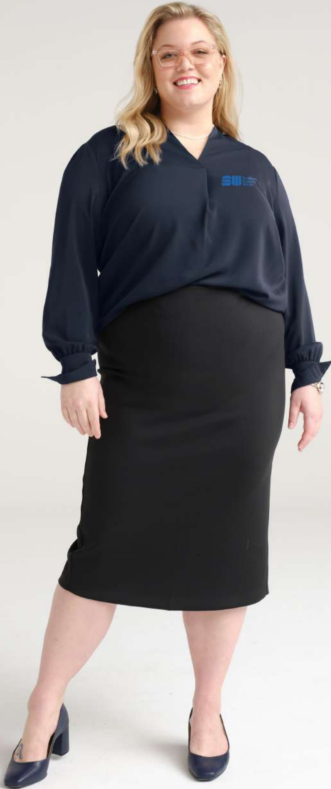
BROOKS BROTHERS Women's Open-Neck Satin Blouse BB18009 Women's Sizes: XS-4XL | 4 colors

Buttoned-up should not mean boring. A true classic look brings the team together with a sense of professionalism and pride.