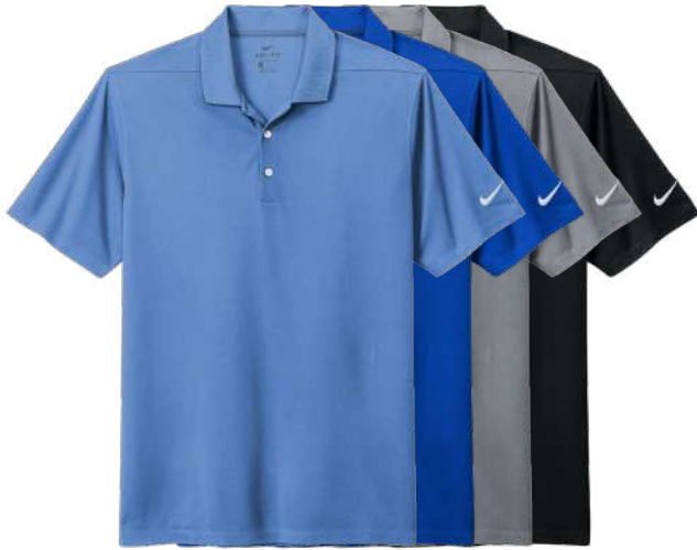
NIKE Dri-FIT Micro Pique 2.0 Polo NKDC1963 Adult Sizes: XS-4XLT | 20 colors