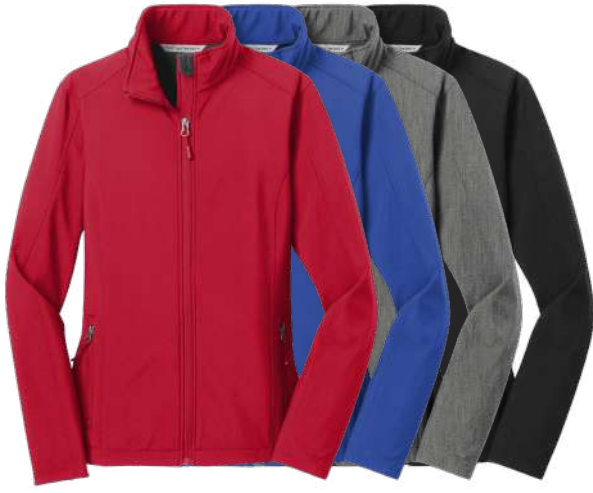
PORT AUTHORITY Ladies Core Soft Shell Jacket L317 Women's Sizes: XS-4XL | 10 colors