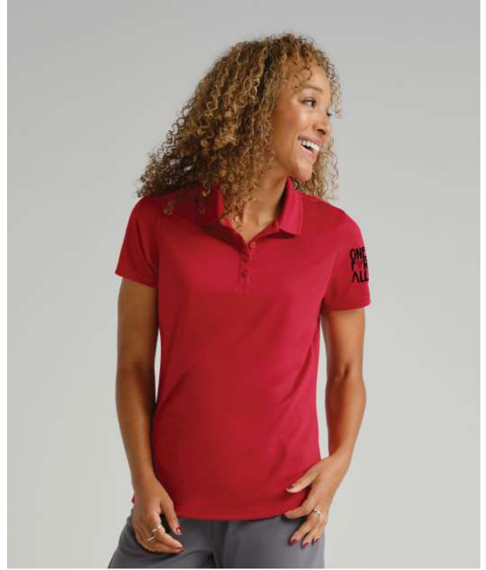
PORT AUTHORITY Ladies Dry Zone UV Micro-Mesh Polo LK110 Women's Sizes: XS-4XL | 16 colors