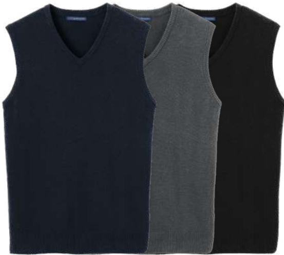
PORT AUTHORITY Sweater Vest SW286 Adult Sizes: XS-4XL | 3 colors