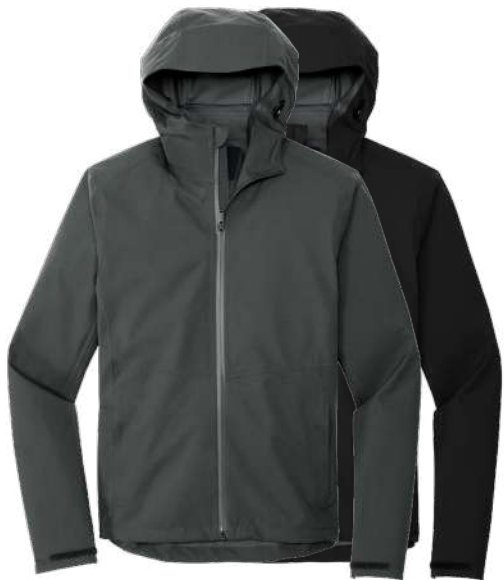
MERCER + METTLE Waterproof Rain Shell MM7000 Adult Sizes: XS-4XL | 2 colors