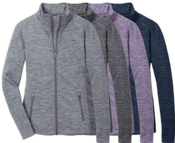
PORT AUTHORITY Ladies Digi Stripe Fleece Jacket L231 Women's Sizes: XS-4XL | 4 colors