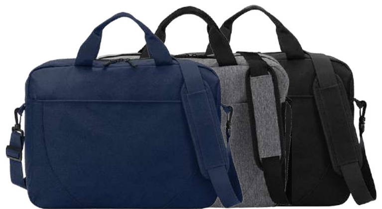
PORT AUTHORITY Access Briefcase BG318 3 colors