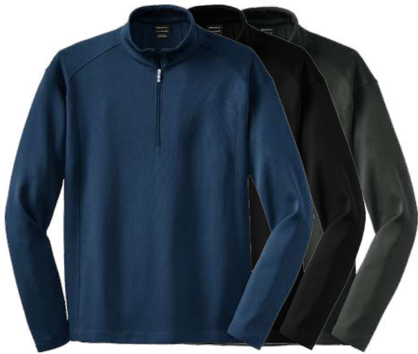
NIKE Sport Cover-Up 400099 Adult Sizes: XS-4XL | 3 colors