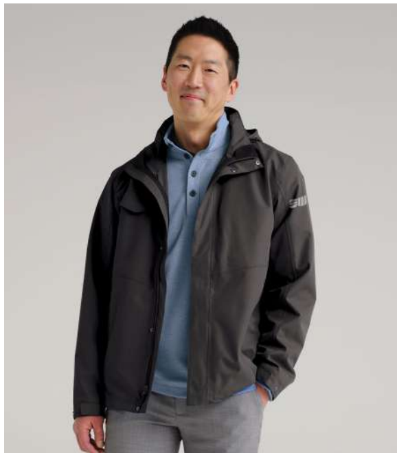
PORT AUTHORITY Collective Outer Shell Jacket J900 Adult Sizes: XS-4XL | 4 colors Worn with NKDC2104, BB18202