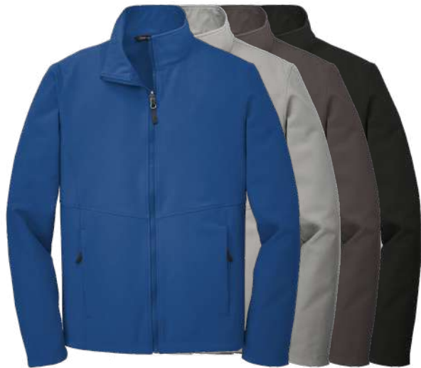
PORT AUTHORITY Collective Soft Shell Jacket J901 Adult Sizes: XS-4XL | 5 colors