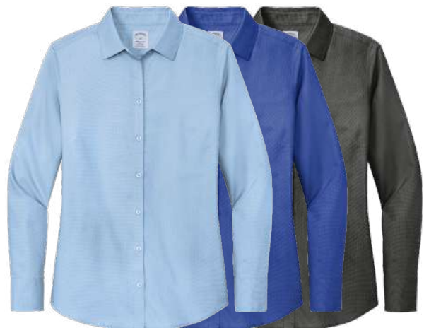
BROOKS BROTHERS Wrinkle Free Women's Stretch Nailhead Shirt BB18003 Women's Sizes: XS-4XL | 6 colors