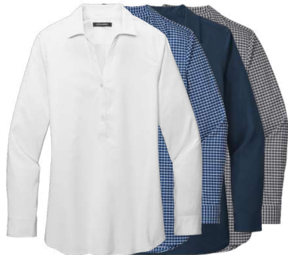
PORT AUTHORITY Ladies City Stretch Tunic LW680 Women's Sizes: XS-4XL | 5 colors