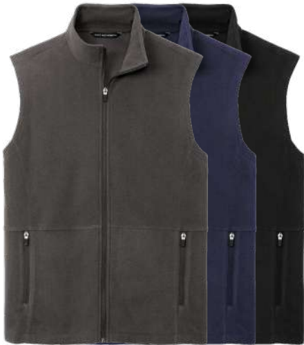
PORT AUTHORITY Accord Microfleece Vest F152 Adult Sizes: XS-4XL | 3 colors