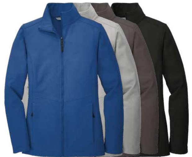
PORT AUTHORITY Ladies Collective Soft Shell Jacket L901 Women's Sizes: XS-4XL | 5 colors