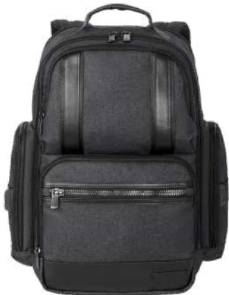
BROOKS BROTHERS Grant Backpack BB18820 1 color