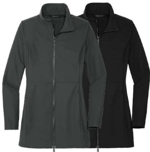
MERCER + METTLE Women's Faille Soft Shell MM7101 Women's Sizes: XS-4XL | 2 colors