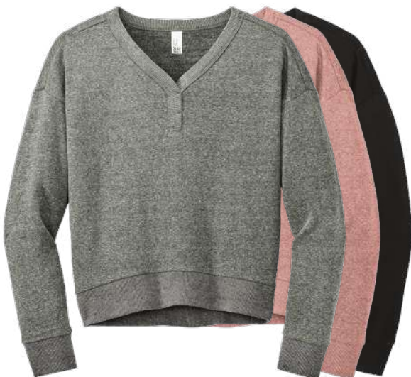
DISTRICT Ladies Perfect Tri Fleece V-Neck Sweatshirt DT1312 Women's Sizes: XS-4XL | 5 colors