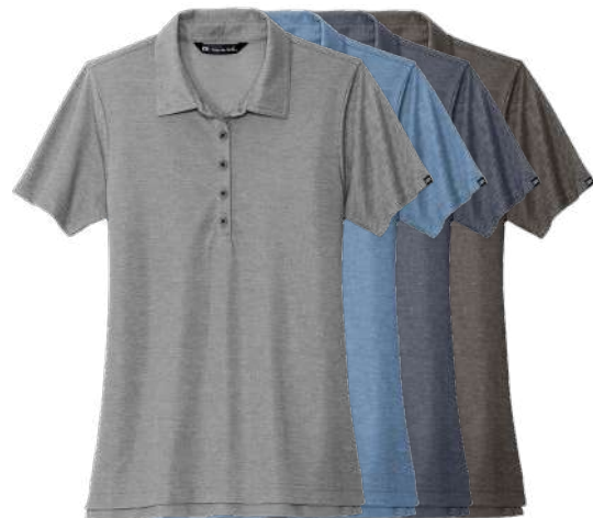
TRAVISMATHEW Ladies Oceanside Heather Polo TM1WW002 Women's Sizes: S-2XL | 6 colors