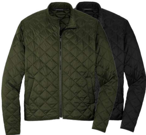
MERCER + METTLE Quilted Full-Zip Jacket MM7200 Adult Sizes: XS-3XL | 2 colors