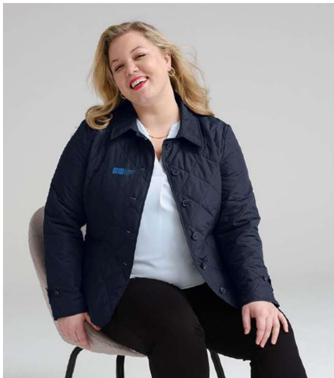
BROOKS BROTHERS Women's Quilted Jacket BB18601 Women's Sizes: XS-4XL | 2 colors Worn with BB18009