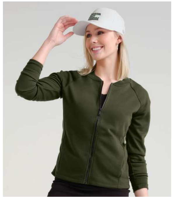
MERCER + METTLE Women's Double-Knit Bomber MM3001 Women's Sizes: XS-4XL | 4 colors Worn with TM1MU426

One size rarely fits all. A modern look represents a cohesive group that gives each member of the team the room to be themselves.