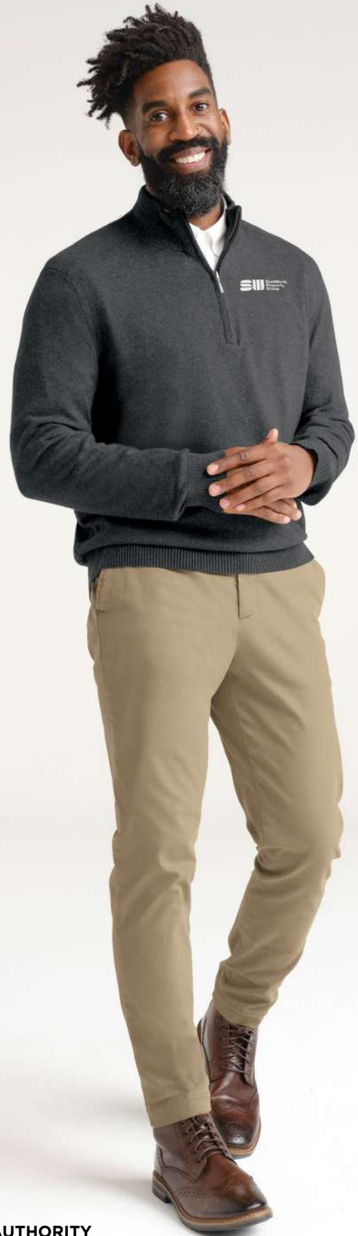
PORT AUTHORITY 1/2-Zip Sweater SW290 Adult Sizes: XS-4XL | 3 colors Worn with BB18002