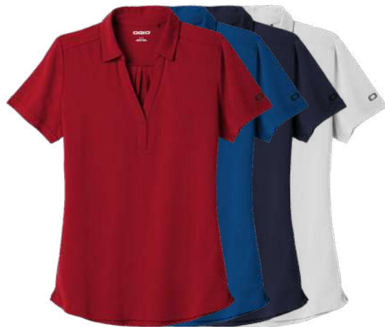
OGIO Ladies Limit Polo LOG138 Women's Sizes: XS-4XL | 7 colors