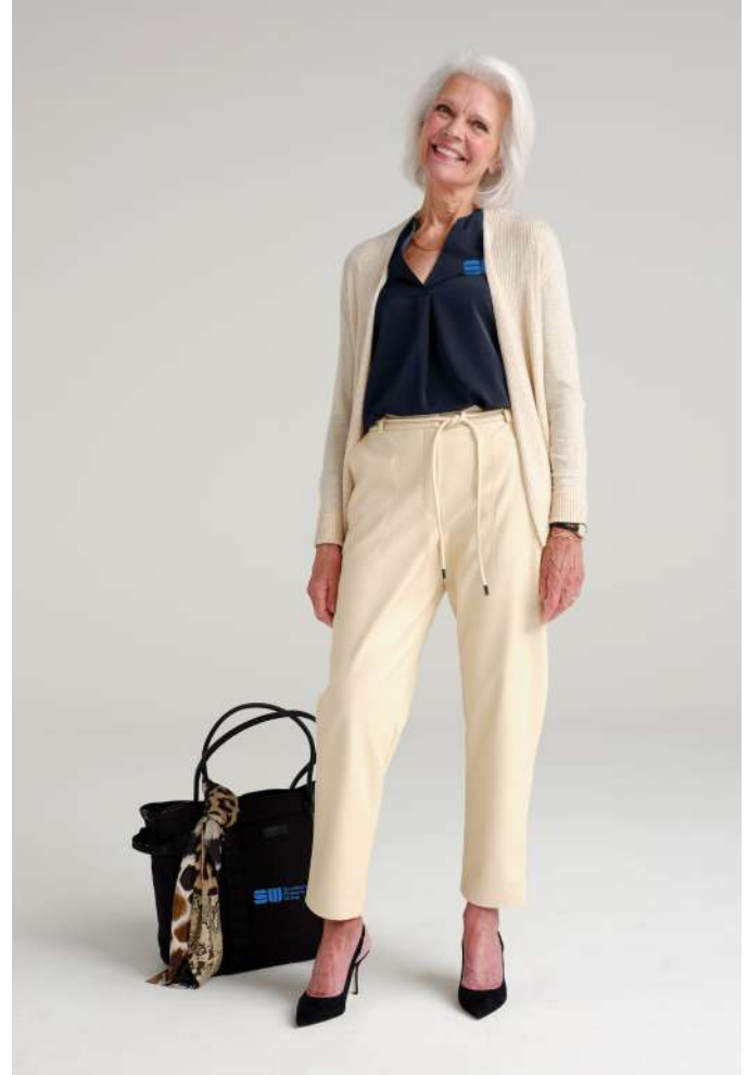
BROOKS BROTHERS Wells Laptop Tote BB18840 2 colors Worn with BB18009, LSW289