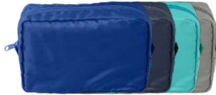
PORT AUTHORITY Stash Dimensional Pouch BG916 6 colors