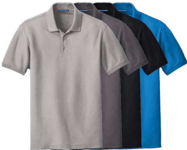
PORT AUTHORITY Core Classic Pique Polo K100 Adult Sizes: XS-6XL | 12 colors