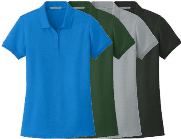
PORT AUTHORITY Ladies Core Classic Pique Polo L100 Women's Sizes: XS-6XL | 13 colors