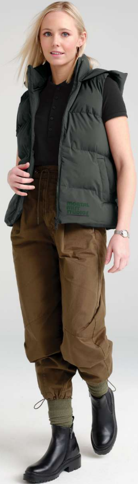
MERCER + METTLE Women's Stretch Heavyweight Pique Polo MM1001 Women's Sizes: XS-4XL | 8 colors