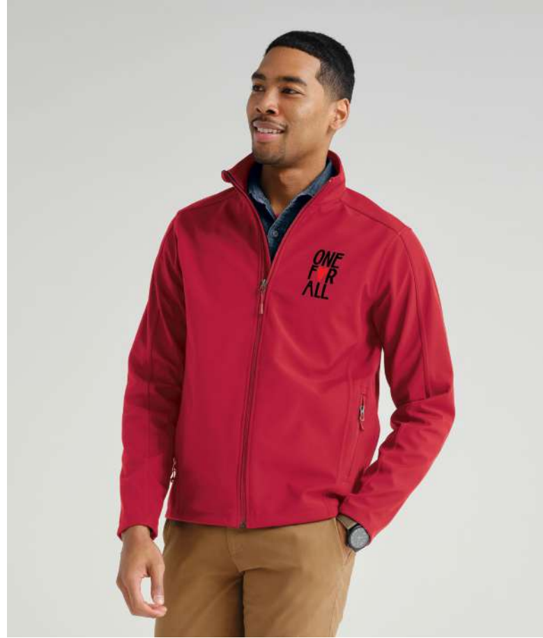
PORT AUTHORITY Core Soft Shell Jacket J317 Adult Sizes: XS-6XL | 11 colors Worn with W676