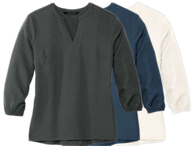
MERCER + METTLE Women's Stretch Crepe 3/4-Sleeve Blouse MM2011 Women's Sizes: XS-4XL | 5 colors