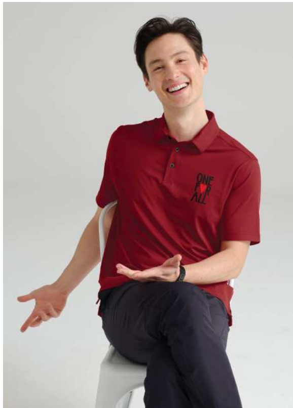
PORT AUTHORITY City Stretch Polo K682 Adult Sizes: XS-4XL | 6 colors