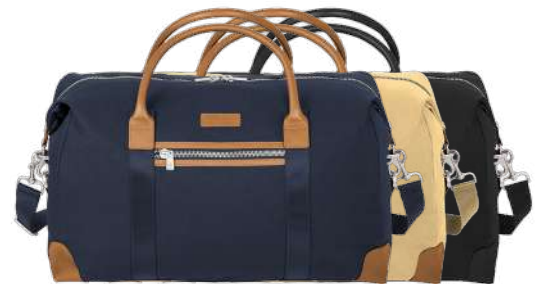
BROOKS BROTHERS Wells Duffel BB18880 3 colors

Heat Transfer is the most effective technique for these styles