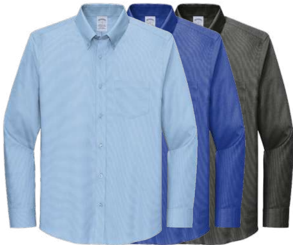
BROOKS BROTHERS Wrinkle Free Stretch Nailhead Shirt BB18002 Adult Sizes: XS-4XL | 6 colors