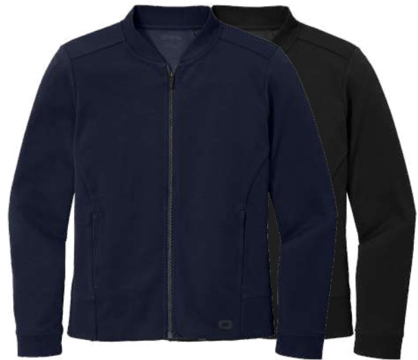
OGIO Ladies Hinge Full-Zip LOG820 Women's Sizes: XS-4XL | 3 colors