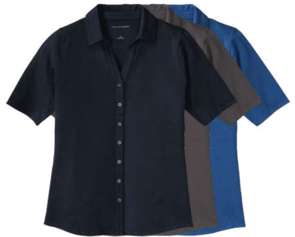
PORT AUTHORITY Ladies City Stretch Top LK682 Women's Sizes: XS-4XL | 5 colors