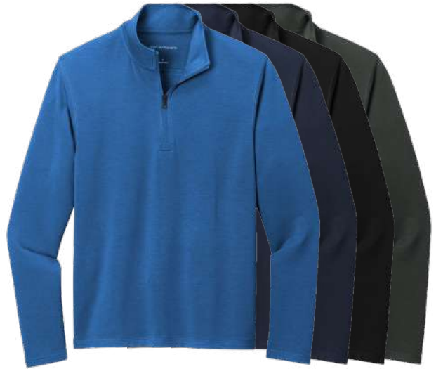
PORT AUTHORITY Microterry 1/4-Zip Pullover K825 Adult Sizes: XS-4XL | 4 colors