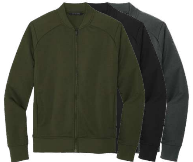
MERCER + METTLE Double-Knit Bomber MM3000 Adult Sizes: XS-4XL | 4 colors