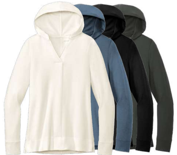
PORT AUTHORITY Ladies Microterry Pullover Hoodie LK826 Women's Sizes: XS-4XL | 4 colors