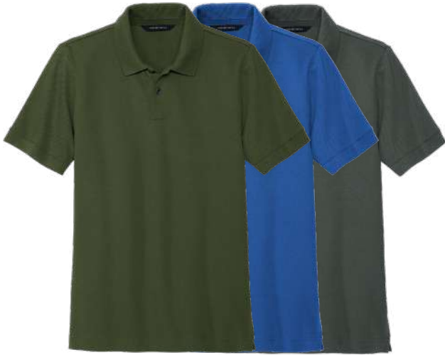
MERCER + METTLE Stretch Heavyweight Pique Polo MM1000 Adult Sizes: XS-4XL | 8 colors