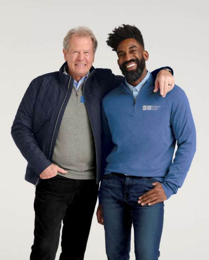
BROOKS BROTHERS Cotton Stretch 1/4-Zip Sweater BB18402 Adult Sizes: XS-4XL | 4 colors