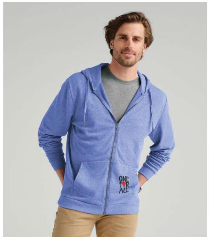
DISTRICT Perfect Tri Fleece Full-Zip Hoodie DT1302 Adult Sizes: XS-4XL | 6 colors Worn with DM130