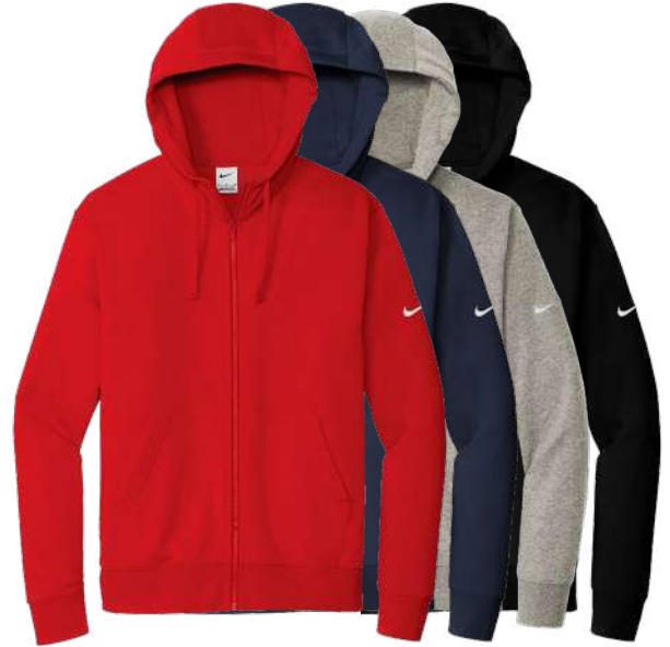
NIKE Club Fleece Sleeve Swoosh Full-Zip Hoodie NKDR1513 Adult Sizes: XS-4XL | 6 colors