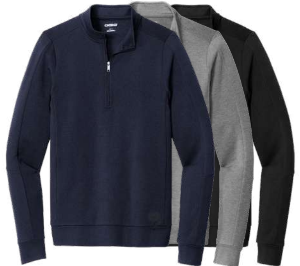
OGIO Luuma 1/2-Zip Fleece OG813 Adult Sizes: XS-4XL | 3 colors