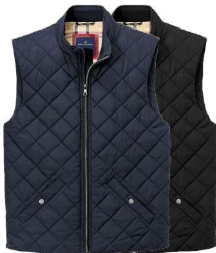
BROOKS BROTHERS Quilted Vest BB18602 Adult Sizes: XS-4XL | 2 colors