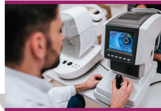
THE "PUFF TEST" AND RETINAL SCANS HELP DETECT GLAUCOMA

It's important to note that there is no cure for glaucoma, nor is it possible to reverse the damage it causes. Early detection and treatment are key.