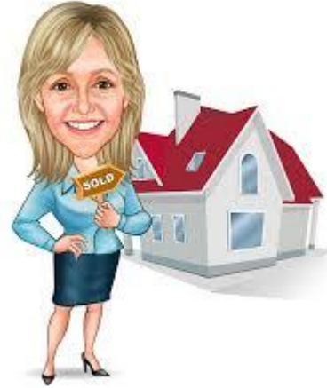
Real Estate Agent