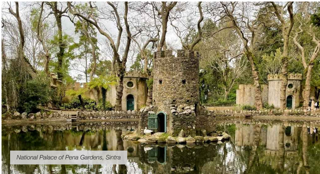
National Palace of Pena Gardens, Sintra