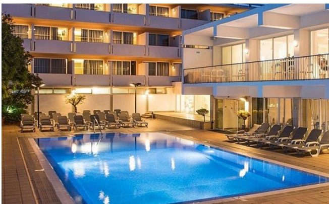
Hotel Londres Estoril

Inspired by the magical atmosphere of these sites, archetypal themes in fairytales will be highlighted throughout each week. ITW teachers will take turns facilitating late evening gatherings focused on a fairytale or myth chosen to amplify case material and “prepare the unconscious for the next day” . Since 2010 ISST has conducted Intensive Training Weeks in the Netherlands, Bulgaria, Poland, Latvia, and Malta. Originally designed to provide introductory Sandplay training in areas where it was not available, the ITW is now designed to accommodate a wider range of trainees interested in experiencing the universality of Sandplay therapy by being part of an international, multi-cultural learning community.