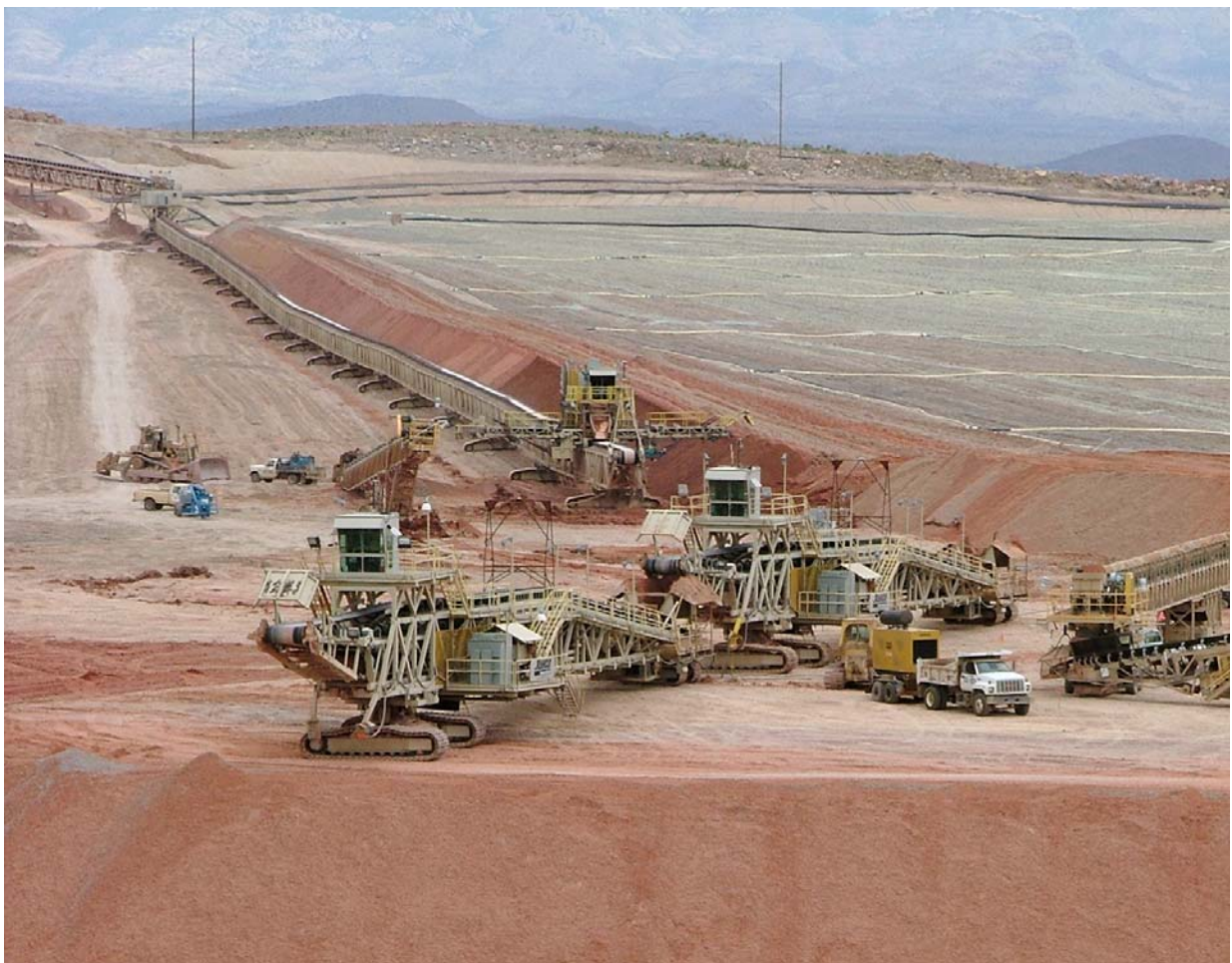
Stack loading at heap leach operation, Morenci