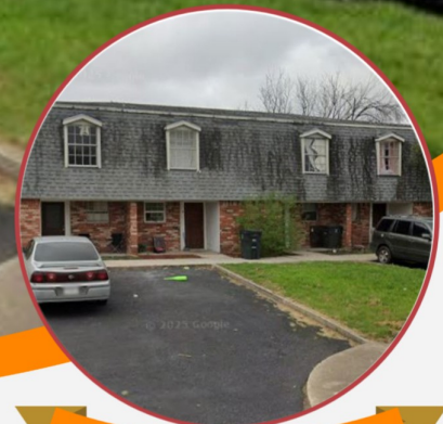
4210 Lake Rd