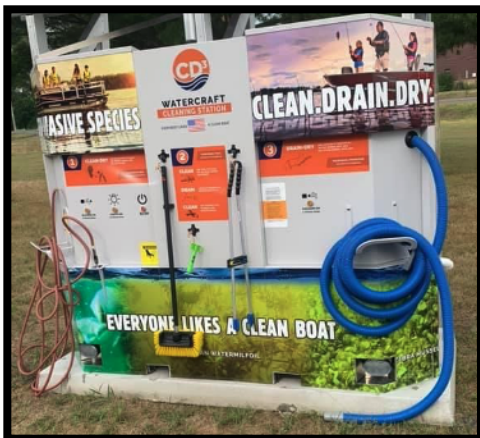
Clean in/out station to control milfoil and other invasive species