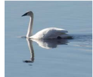
Trumpeter Swan seen on Cross Lake 1-Apr-2017

Area Fisheries Supervisor | Division of Fish & Wildlife | Minnesota DNR leslie.george@state.mn.us