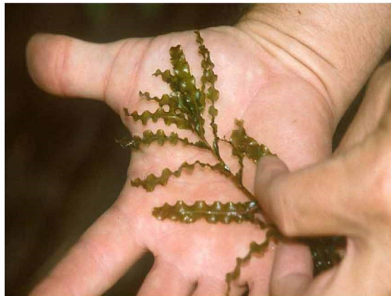
Curly-leaf Pondweed first found in Minnesota in 1910

In spring, curly-leaf pondweed can form dense mats that may interfere with boating and other recreation on lakes. Curly-leaf also can cause ecological problems because it can displace native aquatic plants. In mid-summer, curly-leaf plants usually die back, which results in rafts of dying plants piling up on shorelines, and often is followed by an increase in phosphorus, a nutrient, and undesirable algal blooms. Like other