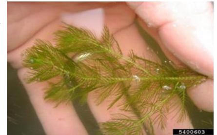
Eurasian Water Milfoil

Permission to Spray Forms. This year I am attempting to streamline the process for sending out and returning the forms. I will be providing the forms on-line in several locations: Our CLA Facebook page, our CLA Website , and The Crossings Newsletter (September issue). Once you fill it out and date it, send it back to me. I will accept the document as a text (photo), email, or by US Mail. Which ever is most convenient to you. I will follow up with those I haven't heard from sometime in February. I emphasize that the DNR does verify every form with the Pine County Tax Assessor's Office prior to approval of the permit so please have the legal property owner sign the document.