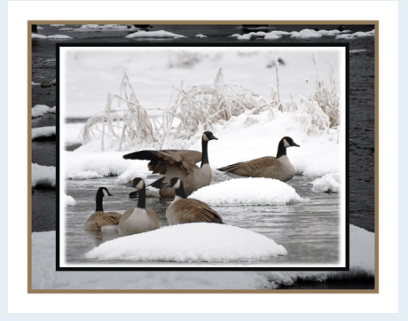
Our Pine City Geese Community on the Snake River near the Damn