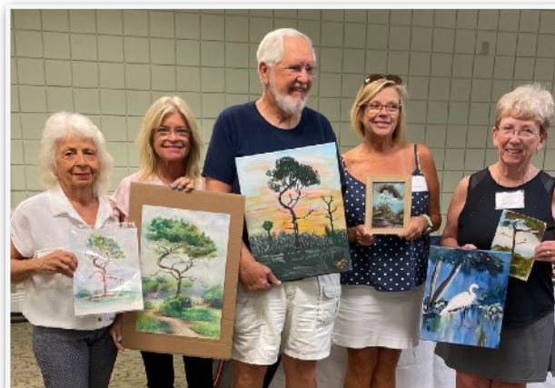
May's Monthly Paint Challenge

Please note that you have to be a current PCAA member to hang and sell your artwork at our venues. If you have not paid your dues yet, please do so ASAP. •form attached•