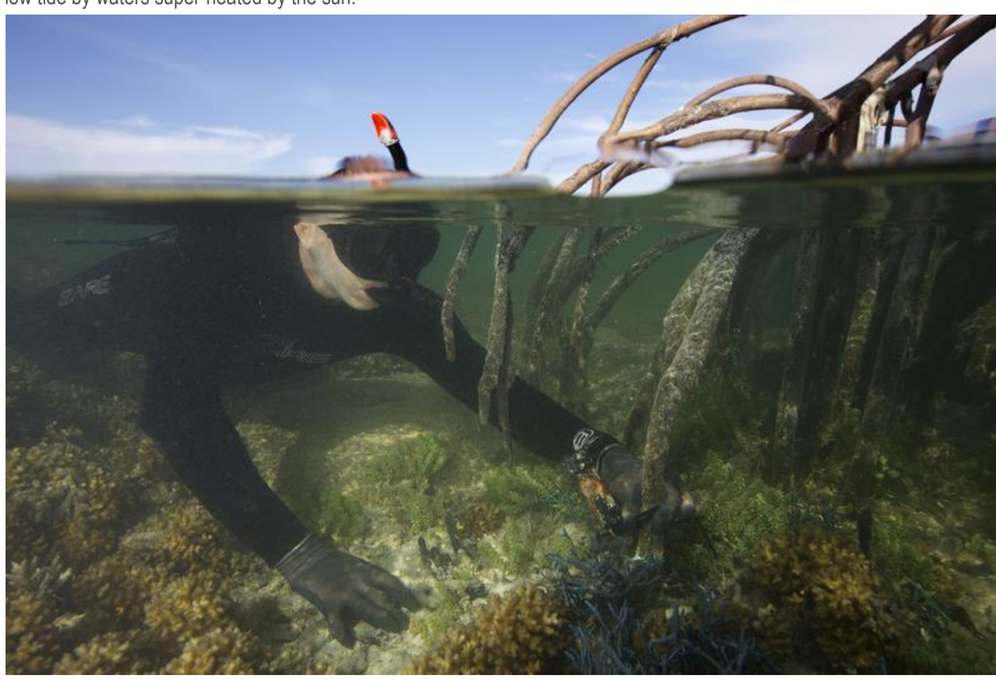
Mark Erdmann placing a temperature logger in a mangrove-fringed coral lagoon exposed to very high midday temperatures.

Undoubtedly the reasons for Raja's resilient reefs are complex and numerous, but we believe that one of the most important factors is that its reefs are normally exposed to a wide variation in temperatures, basically "pre-adapting" them to climate change. We've been monitoring ocean temperatures in the Bird's Head Seascape since 2005 with a set of 78 temperature loggers that measure temperature every 15 minutes and record it onto a computer chip. Through this work, we've identified a number of reef areas which are regularly exposed to oceanographic upwellings of deep cold water, as well as a number of healthy shallow reefs which are literally "cooked" every day at low tide by waters super-heated by the sun.