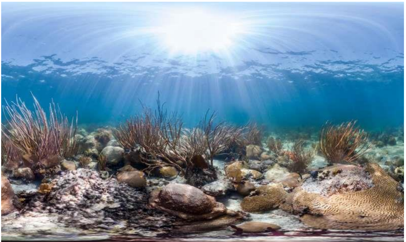
Cheeca Rocks in the Florida Keys.

The marine scientists measured the loss of coral reef habitats across a large geographic area, while most studies look more closely at the loss of living coral from smaller sections of the reef.