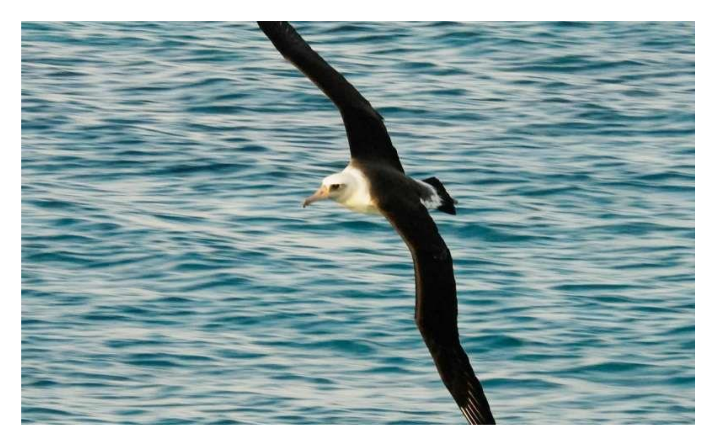
The Laysan albatross breeds within the EEZ of the United States, but forages widely over the North Pacific.