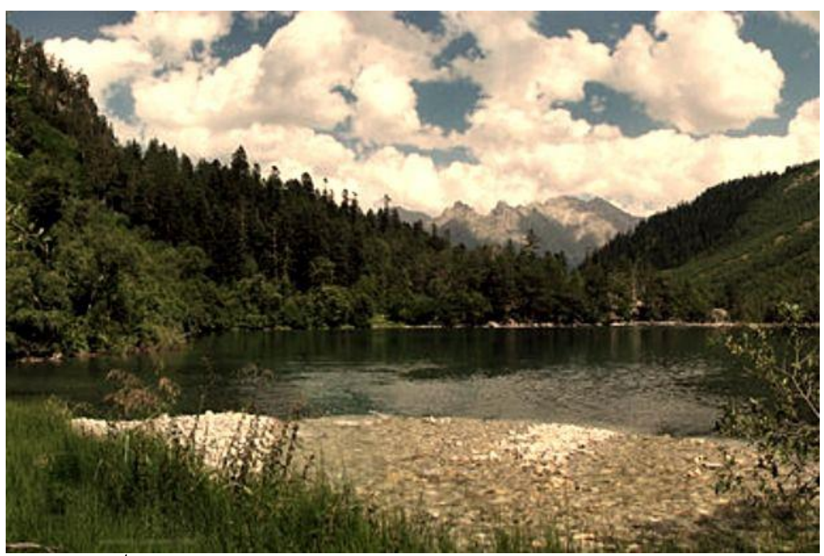
Figure 1: 1st most Polluted River/Lakes in the world, Lake Karachay