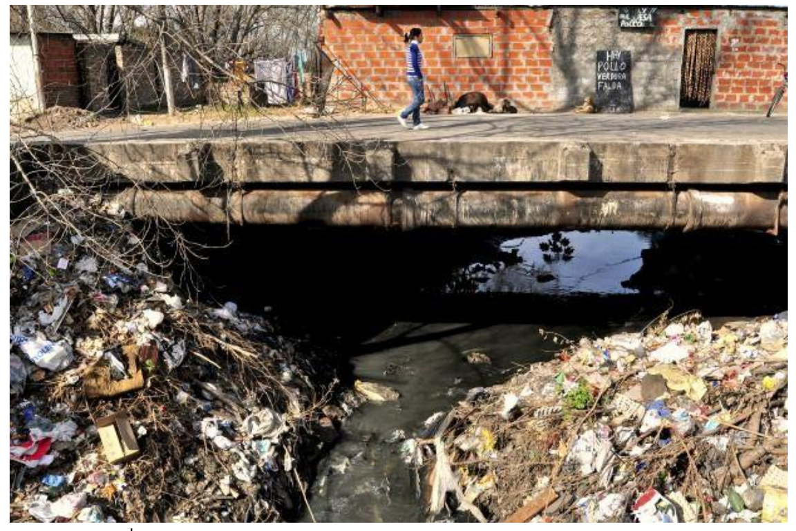
Figure 2: 2<sup>nd</sup> most Polluted River/Lakes in the world, Matanza-Riachuelo River, New Mexico.