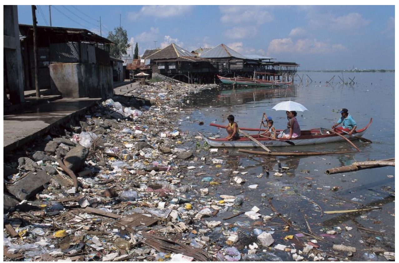
Figure 1 : The coast of the Philippines depicts water pollution, a problem affecting most of the world in one form or another.