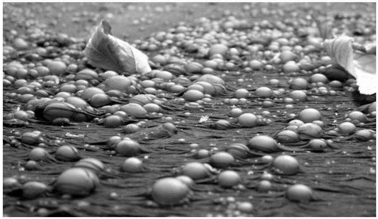
Figure 3: Excessive growth of filamentous algae on the surface of water