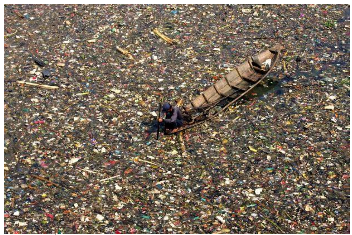
Figure 3: 3<sup>rd</sup> most Polluted River/Lakes in the world, Citarum River, west Java, Indonesia.