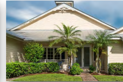
$615,000 6367 197th Place N, Jupiter