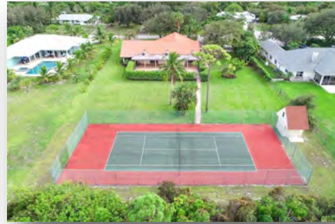
$565,000 Woodmere 8313 SE Woodmere, Hobe Sound