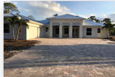
$1,465,000 Fox Run 6546 N 197th Pl, Jupiter