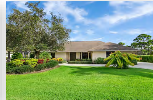
$635,000 Turtle Creek 186 SE Turtle Creek Dr, Teq.