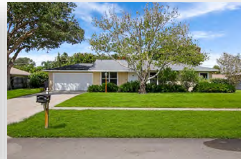
$407,000 Wendimere Heights 19841 Hibiscus Drive, Tequesta