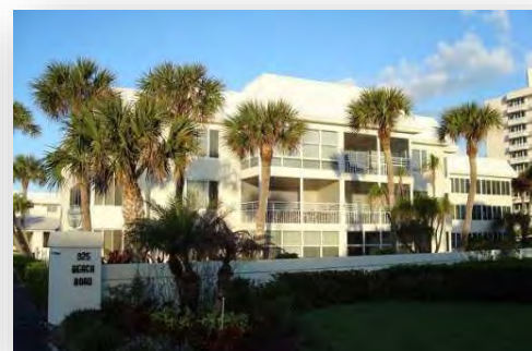
$485,000 Island House 325 Beach Road 109, 110, Te-