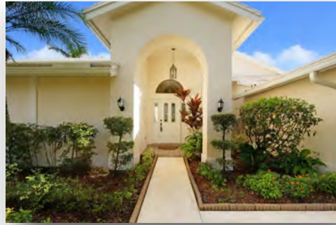
$465,000 The Shores 6294 Misty Lake Way, Jupiter