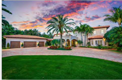
$5,000,000 Anchorage Point 19000 Point Drive, Tequesta