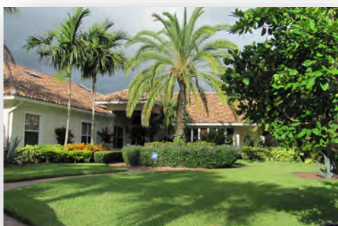
$960,000 Country Club 267 River Drive, Tequesta