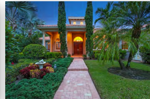
$1,560,000 Estates Home 18940 SE Castle Rd, Jupiter