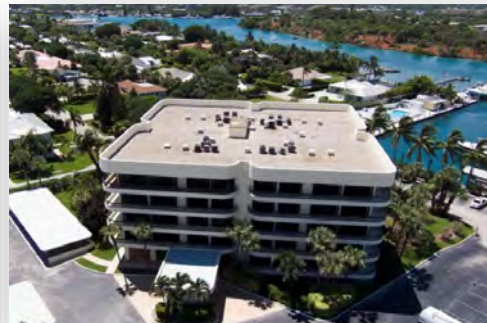
$700,000 Jib Club Condo 50 Beach Road 504