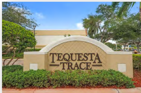
$218,000 Tequesta Trace 107 Lighthouse Circle, H, Teq.