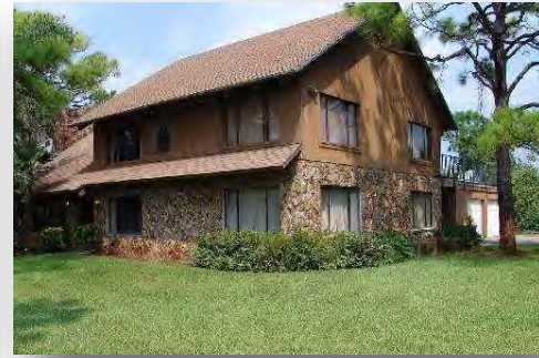
$640,000 River Club 5725 River Club Circle, Jupiter