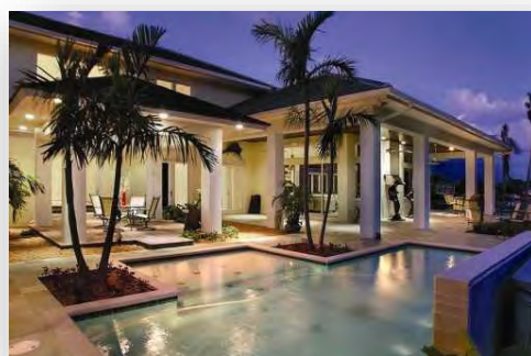
$1,207,000 Heritage Oaks 10482 SE Banyan, Tequesta