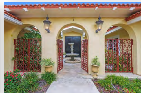
$415,000 Turtle Creek 7 Loggerhead Lane, Tequesta