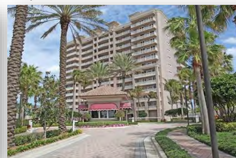
$930,000 Ocean Royale 750 E Ocean Royale 1203, Juno Beach