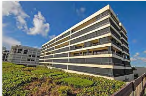
$847,500 Ocean Sound 19900 Beach Road 302