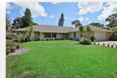
$475,000 Fox Run 6498 Fox Run Circle, Jupiter