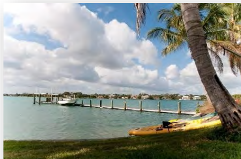
$1,482,000 Tequesta 16 Yacht Club Place