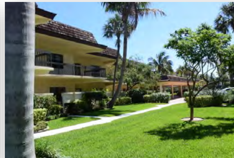
$500,000 Seamist Condo 275 Beach Road 201e