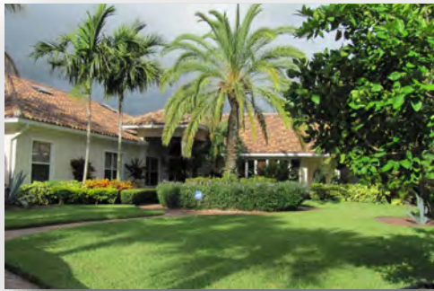
$960,000 Country Club 267 River Drive, Tequesta