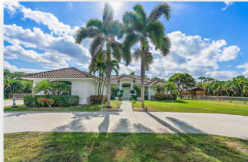
$765,000 Jupiter Farms 11716 165th Rd N, Jupiter