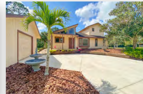
$373,000 Jupiter Farms 10380 151st Ln N, Jupiter