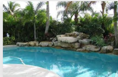
$531,194 Coconut Cove 4 Coconut, Tequesta