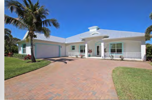
$795,000 Rolling Hills 17277 SE Galway Court, Teq.