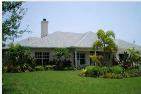
$25,000 Turtle Creek 17 SE Club Circle, Tequesta