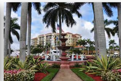
$660,000 Jupiter Yacht Club 600 S US Highway 1 110, Jupiter