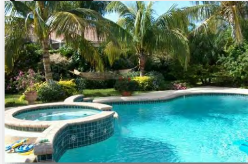
$660,000 The Moorings 8520 SE Island Way, Jupiter