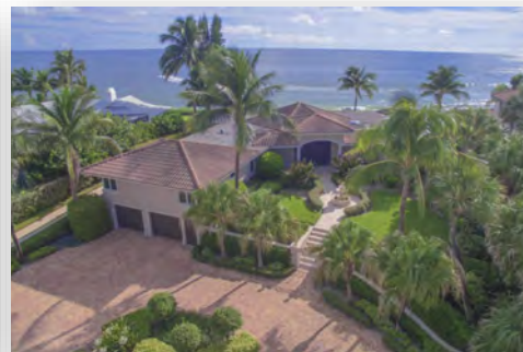
4,650,000 Jupiter Inlet Colony 12 Ocean Drive