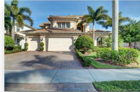
$1,100,000 Frenchmans 316 Charroux Drive, Jupiter