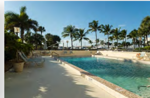
$410,000 Jib Club Condo 50 Beach Road 101