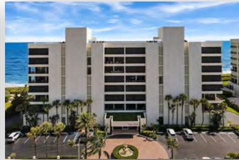
$2,100,000 Ocean Sound 19900 Beach Road 602