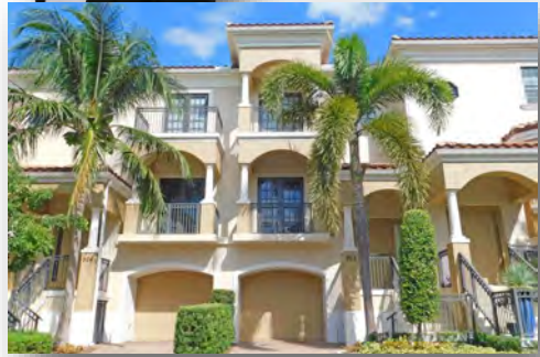
$498,750 Casa Del Sol 305 Del Sol Circle, Tequesta

Madelyn Dickinson 561-214-5517 MadelynDickinson@keyes.com