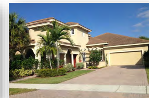
$470,000 Paseos 105 Via Azurra, Jupiter