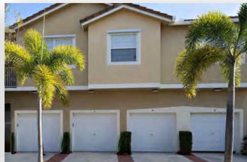
$220,000 Tequesta Trace 108 Lighthouse Circle, A, Teq.