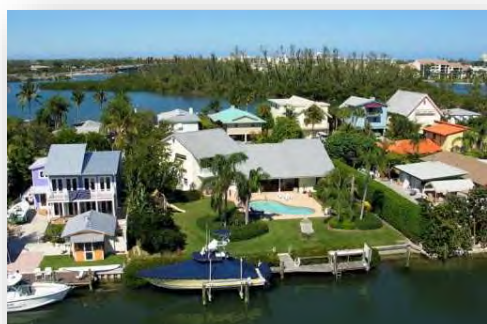
$1,300,000 Yacht Club Estates 202 Elsa Road, Jupiter