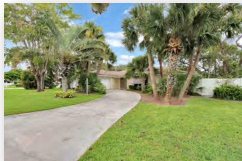
$340,000 Jupiter in the Pines 574 N Dover Rd, Tequesta