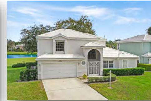
$375,000 North Passage 18125 SE Fairview, Tequesta