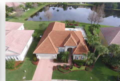
$660,000 Sanctuary 135 Satinwood Lane, Gardens