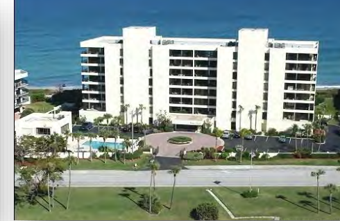
$675,000 Ocean Sound 19900 Beach Road 203