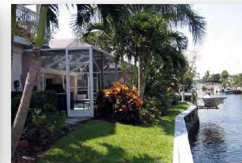
$750,000 Penn Waterway 944 Penn Trail, Jupiter