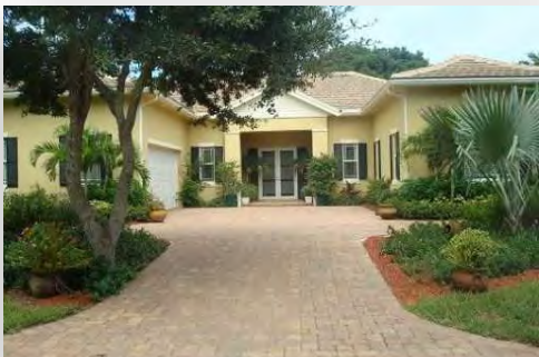
$531,000 Heritage Oaks 9980 SE Canary Palm, Tequesta