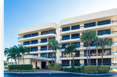
$650,000 Jib Club Condo 50 Beach Road 404