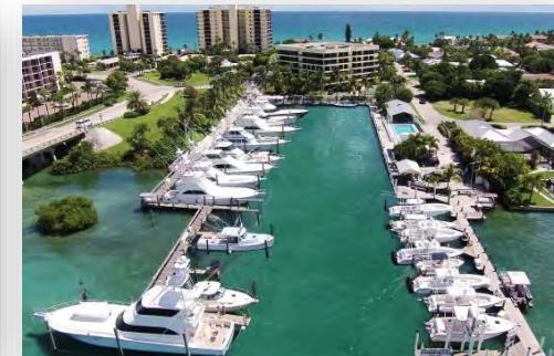
$450,000 Jib Club Condo 50 Beach Road 201