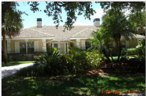
$550,000 Heritage Oaks 10410 SE Banyan Way, Tequesta