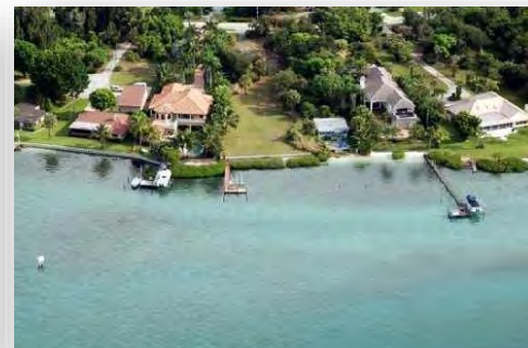
$1,500,000 Riverside Drive Vacant Land