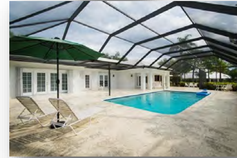
$625,000 Heritage Oaks 18072 SE Heritage Drive, Tequesta