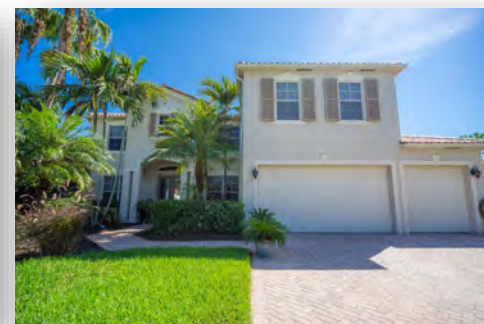
$755,000 Osprey Cove 9879 SE Crape Myrtle Court, Hobe Sound