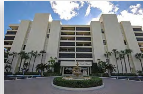
$915,000 Ocean Sound 19900 Beach Road 504