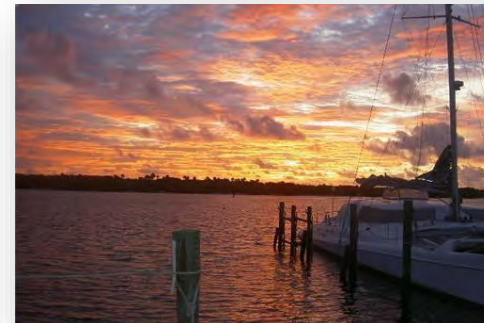
$425,000 Seamist Condo 275 Beach Road 202c