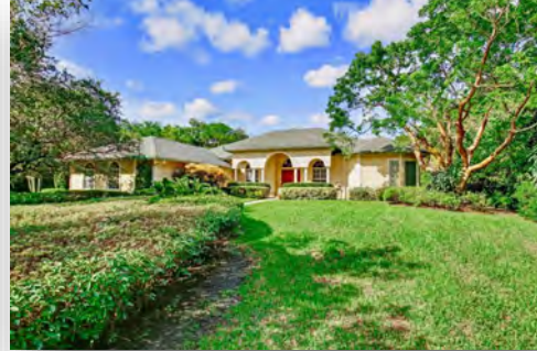
$755,000 Fox Run 6373 Fox Run Circle, Jupiter