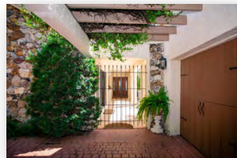
$760,000 Heritage Oaks 18529 SE Heritage Oaks Lane, Tequesta