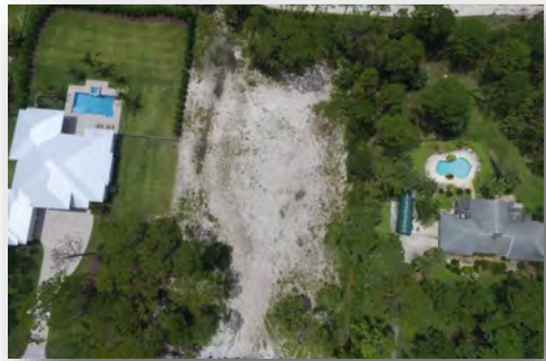
$475,000 Fox Run 6562 N 197th Place, Jupiter