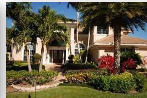
$1,625,000 Island Way 19089 SE Winward Island Way, Jupiter