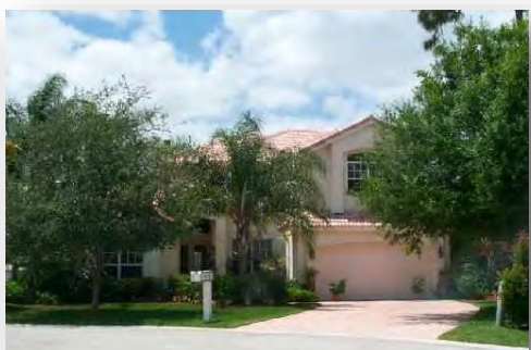
$490,000 Egret Landing 224 Skylark, Jupiter