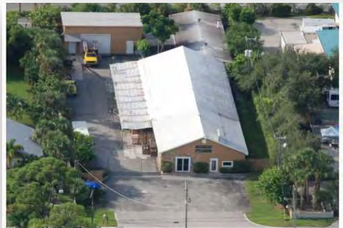
$580,000 Offices 24 Old Jupiter Beach Road, Jupiter