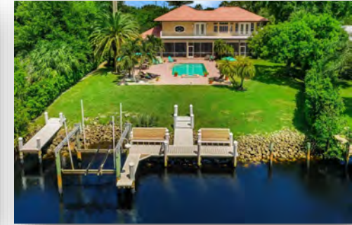
$1,300,000 Loxahatchee Landing 5952 Senegal, Jupiter