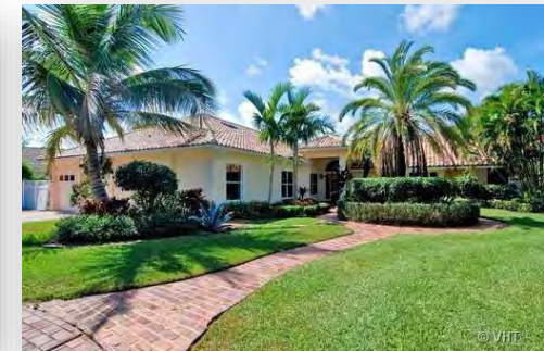
$1,012,500 Tequesta Country Club 267 River Drive