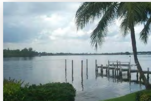
$2,200,000 Country Club 151 Point Circle, Tequesta