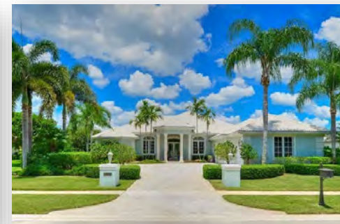
$750,000 Palm Cove 18561 Lakeside Gardens