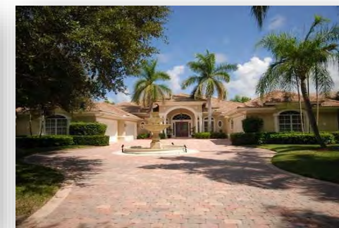
$1,355,000 Island Way 8695 SE Compass Island Way, Jupiter