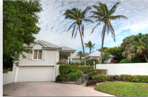
$4,100,000 Jupiter Inlet Colony 23 Ocean Drive