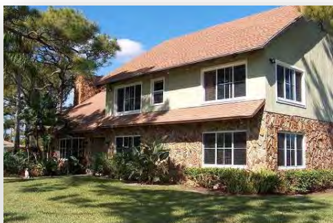
$795,000 River Club 5725 River Club Circle, Jupiter