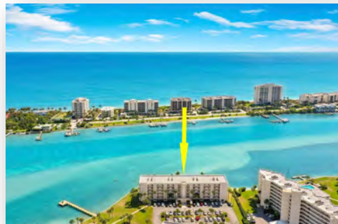
$493,000 Broadview 100 Intracoastal Pl, 208, Teq.