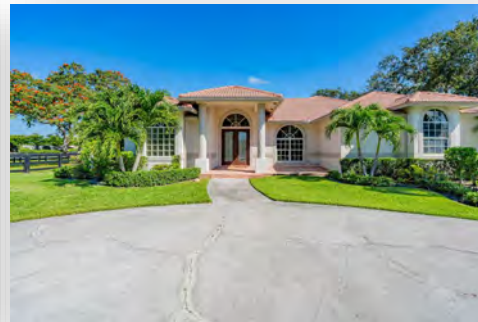
$1,150,000 Wellington 14985 Oatland Court