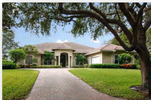
$849,000 Heritage Oaks 9879 SE Buttonwood Way, Tequesta