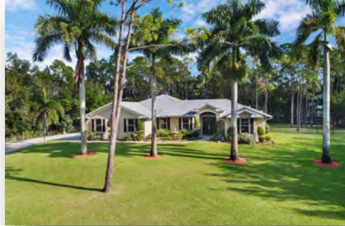
$650,000 Jupiter Farms 12819 Old Indiantown Rd