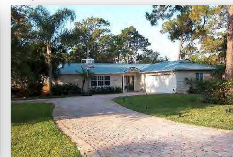
$890,000 Pennock Point 5540 Pennock Point Road, Jupiter