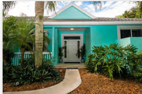
$585,000 1795 April Lane, Jupiter