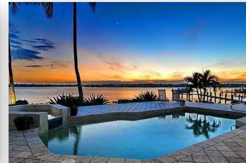
$2,500,000 Bay Harbor 11 Bay Harbor Drive