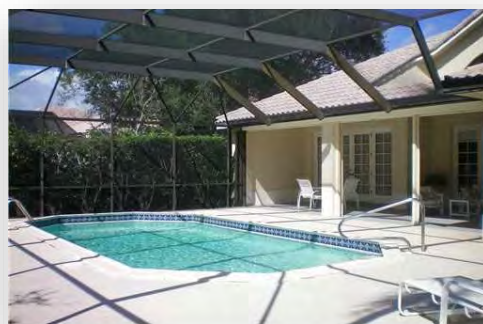
$708,750 Jonathans Landing 3345 Southern Cay Drive, Jupiter