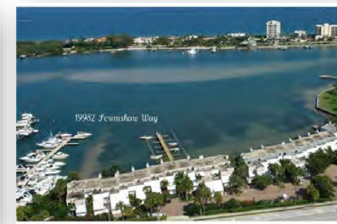
$562,500 Scrimshaw on Bay 19982 Scrimshaw Way, Tequesta