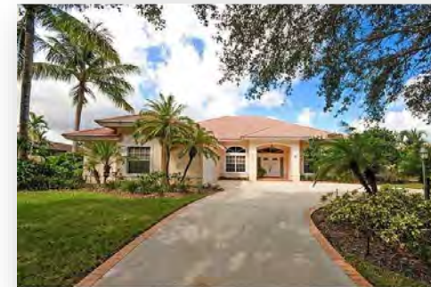
$575,000 Heritage Oaks 18337 Heritage Drive, Tequesta