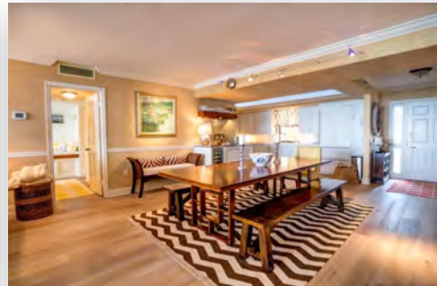
$760,000 Ocean Towers South 100 Beach Road 303