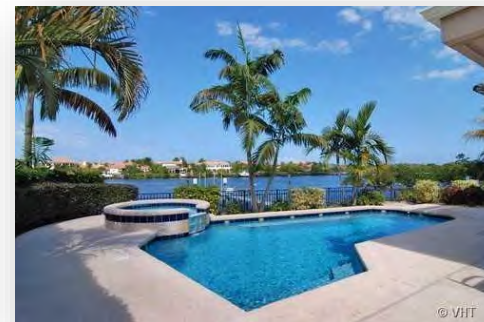
$1,225,000 Lox. Pointe 19786 Loxahatchee Pointe Dr.