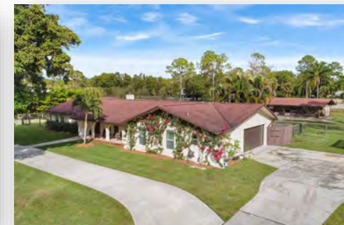
$600,000 Jupiter Farms 16605 115th Ave N, Jupiter