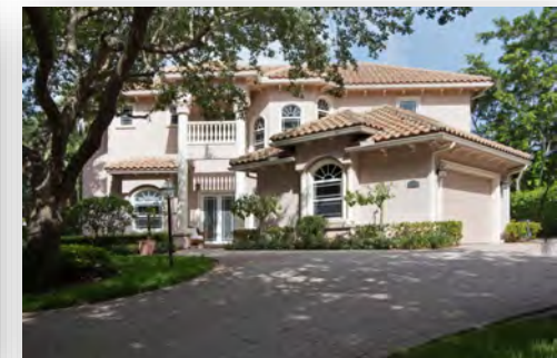
$890,000 Heritage Oaks 18012 SE Heritage Drive