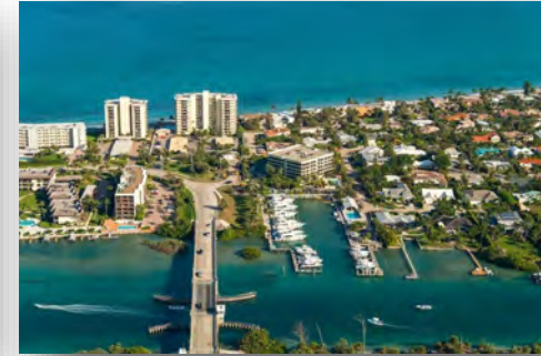
$750,000 Ocean Towers 100 Beach Road 602