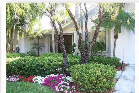
$708,500 Olympus 114 Pegasus Drive, Jupiter