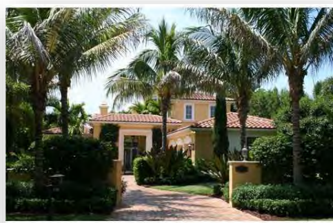
2,600,000 Admirals Cove 336 Eagle Drive, Jupiter