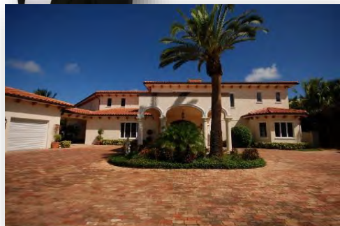
$3,500,000 Anchorage Point 19000 Point Drive, Tequesta

Madelyn Dickinson 561-214-5517 MadelynDickinson@keyes.com