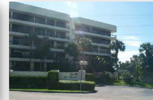
$505,000 JIB Club 50 Beach Road 302, Tequesta