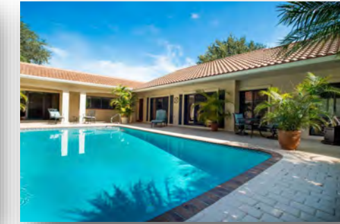
$595,000 Heritage Oaks 18529 SE Heritage Oaks Lane, Tequesta