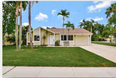
$290,000 Jupiter Landing 6285 Launch Club Circle, Jupiter