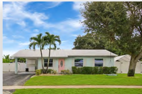
$372,000 Jupiter River Estates 699 Cree Street, Jupiter