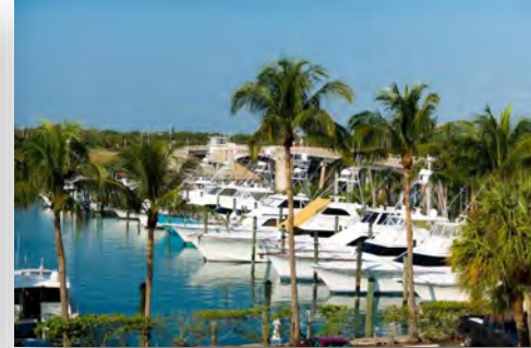
$595,000 Jib Club Condo 50 Beach Road 303