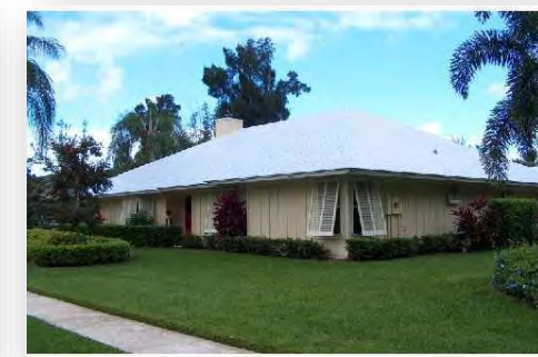
$515,000 Loxahatchee Landing 5873 Senegal Drive, Jupiter