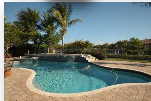
$1,810,000 Island Way 19089 SE Winward Island Way, Jupiter