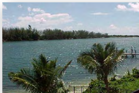
$805,000 Vacant Land 17 SE Federal Highway, Tequesta