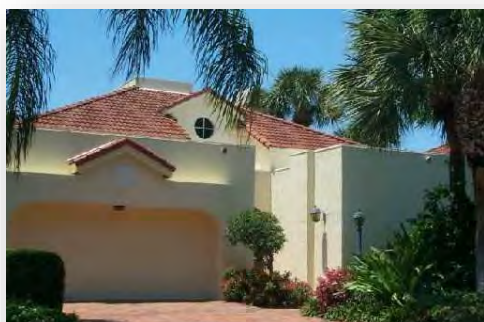
$475,300 Jonathans Landing 16633 Narrows Drive, Jupiter