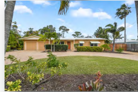
$395,000 Bermuda Terrace 4885 Tequesta Drive, Tequesta