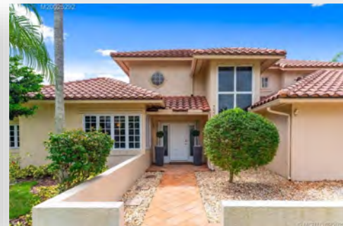
$635,000 River Vista 3301 SE River Vista, PSL