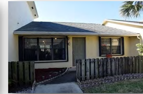
$170,000 Jupiter Lakes 431 Jupiter Lakes 2108c, Jupiter