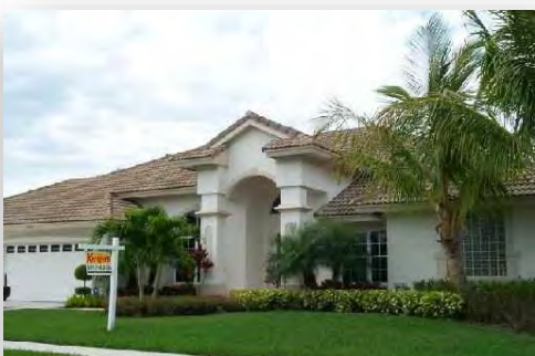
$480,000 Jupiter River Estates 18960 SE Kokomo Lane, Jupiter