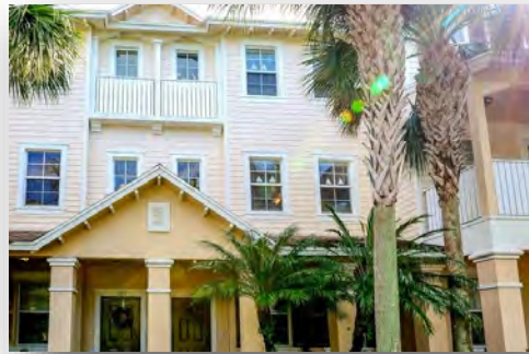
$235,000 Botanica 277 E Bay Cedar, Jupiter