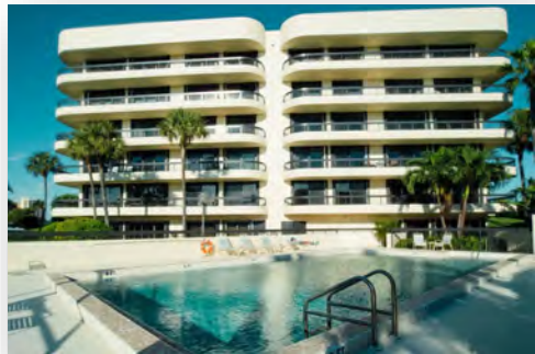
$510,000 Jib Club Condo 50 Beach Road 302