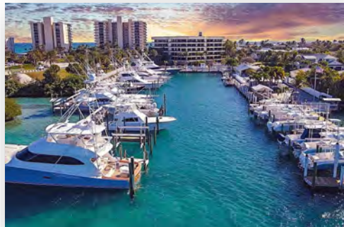
$650,000 Jib Club Condo 50 Beach Road 101