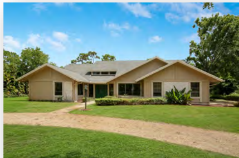
$640,000 Fox Run 6372 Fox Run Circle, Jupiter