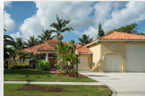
$582,300 The Moorings 18928 SE Loxahatchee River