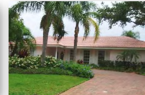
$550,000 Country Club 236 River Drive, Tequesta