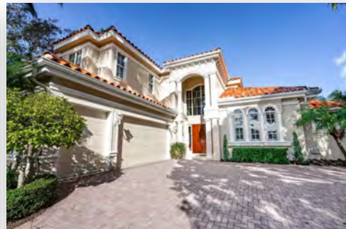
$2,600,000 Barrow Island 3379 Bridgegate Drive, Jupiter