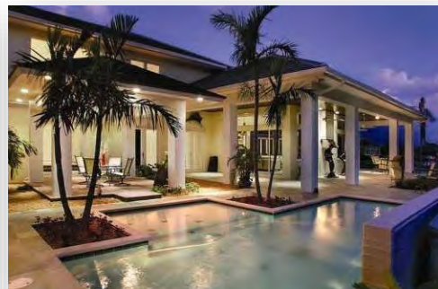
$1,207,000 Heritage Oaks 10482 SE Banyan