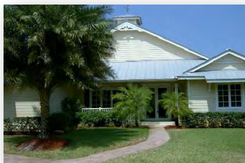
$750,000 6367 197th PI N, Jupiter