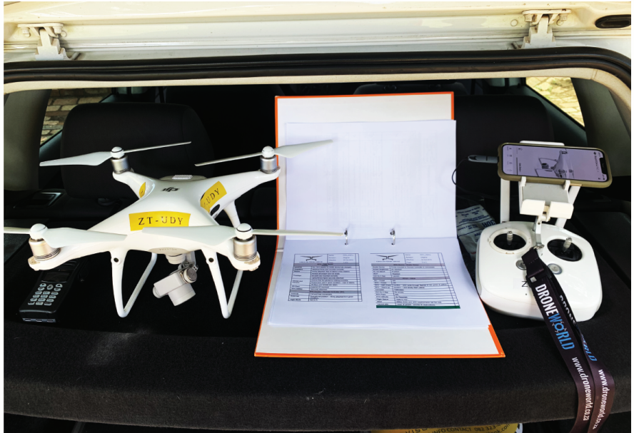
FLIGHT PLAN AND PREP

All flight operations are done within SACAA regulations. Our flight planning is compiled from the risk assessments in conjunction with the flight path planning. Time and attention to detail is placed on this process to ensure all flights are conducted within the most efficient way whilst keeping safe operations as a priority.