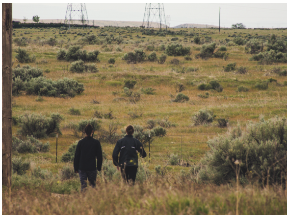
LONG WALKS IN THE SUN

For example, 8ha of ground is covered in 5min @ 1.64 GSD. The technology used for processing the data is accurate and feels like you are operating in the future.