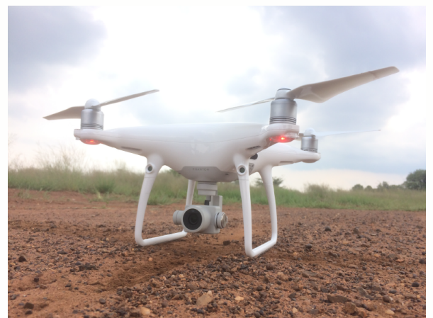
FAST REMOTE PILOTING