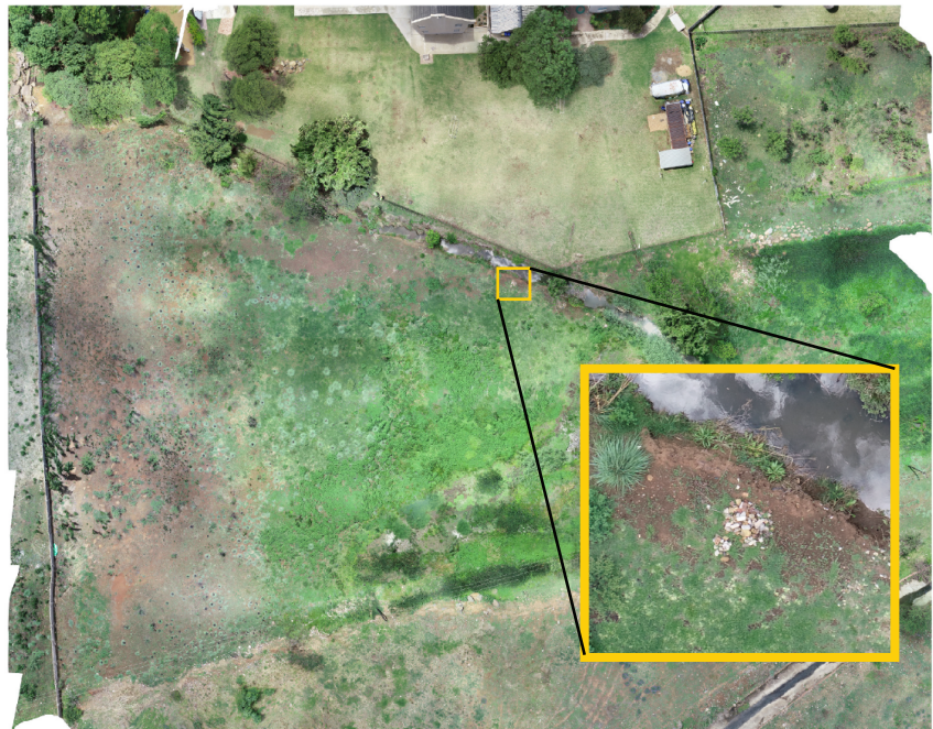
HD FOCUS SQUARE

Using drones to gather information from hard to reach or in some cases impossible to reach areas like cliff sides, long grass areas, reed filled areas or dangerous rocky terrain, etc... This allows for never before data capture to improve research and supply your client with new and unique information.