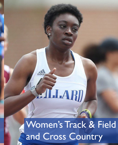
Women's Track & Field and Cross Country