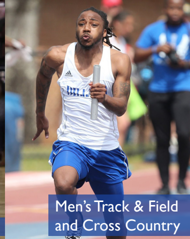
Men's Track & Field and Cross Country