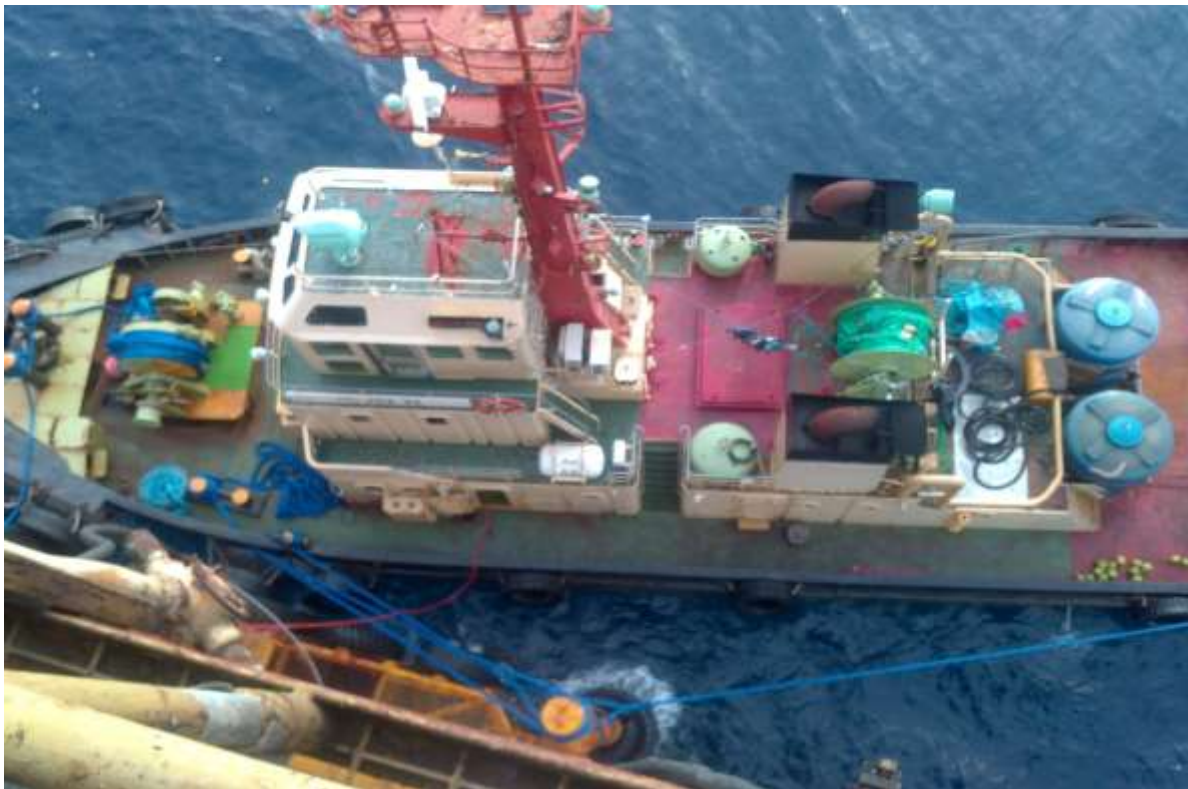
Fuel is being delivered by utilizing tug in Matinloc, Palawan.