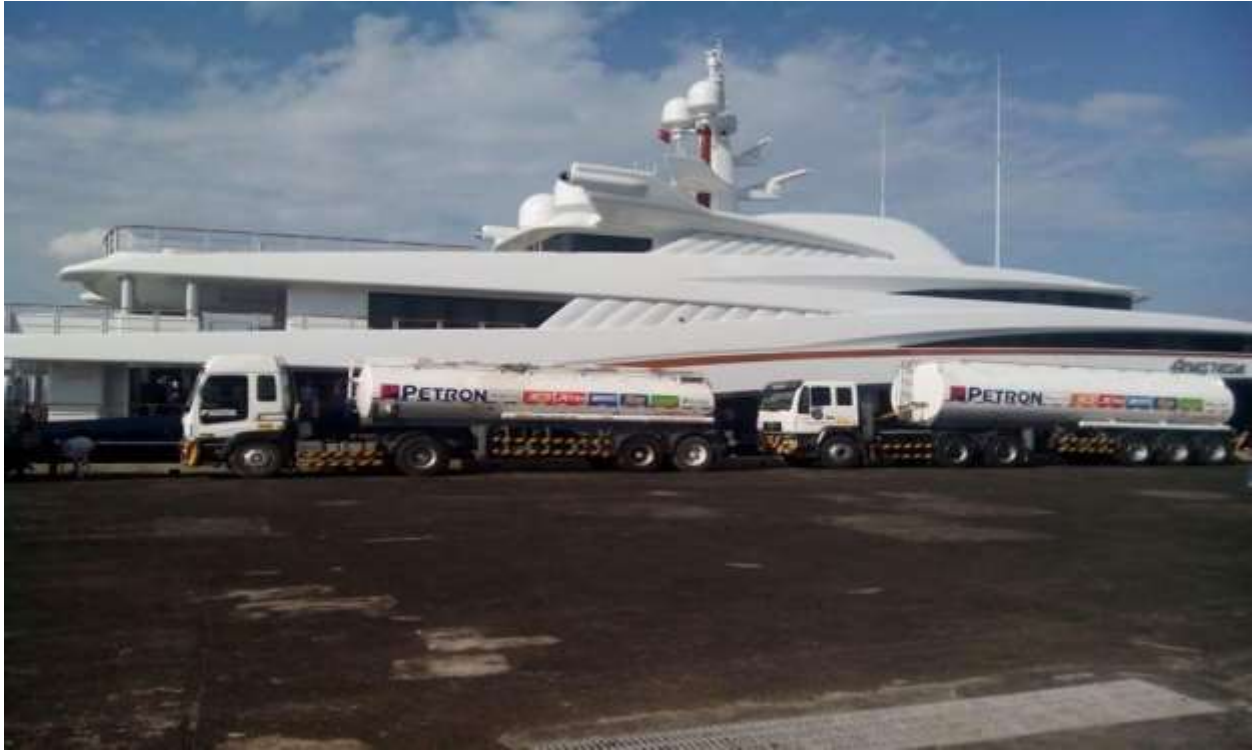
Bunkering of Diesel fuel for Mega Yacht in Subic.