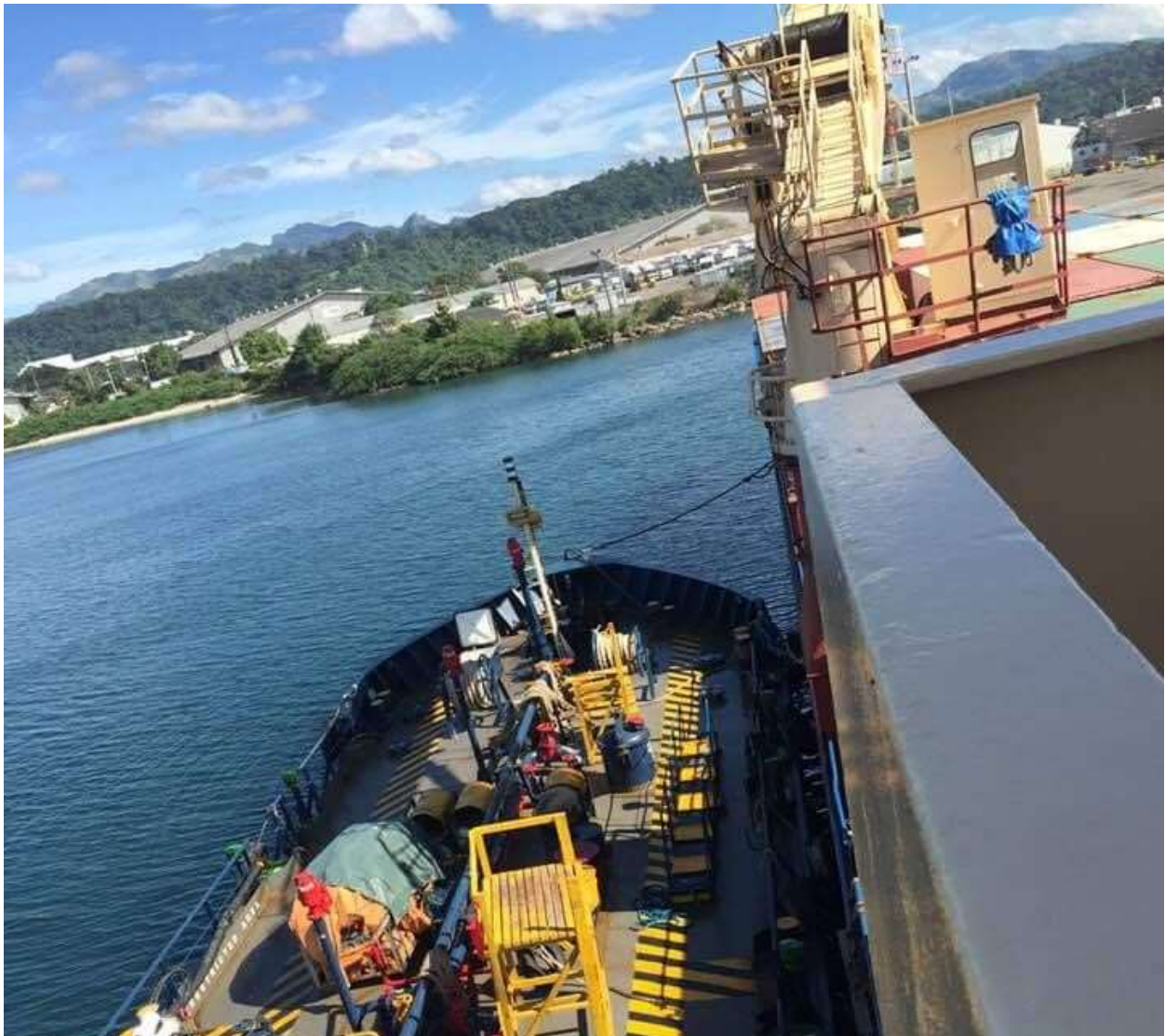
Delivery of diesel fuel via Barge on Foreign Ship.