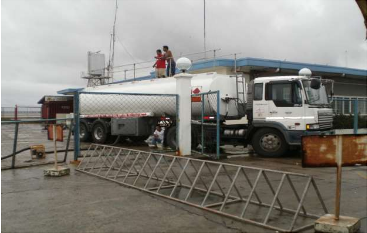
Supply of Diesel in Bataan.