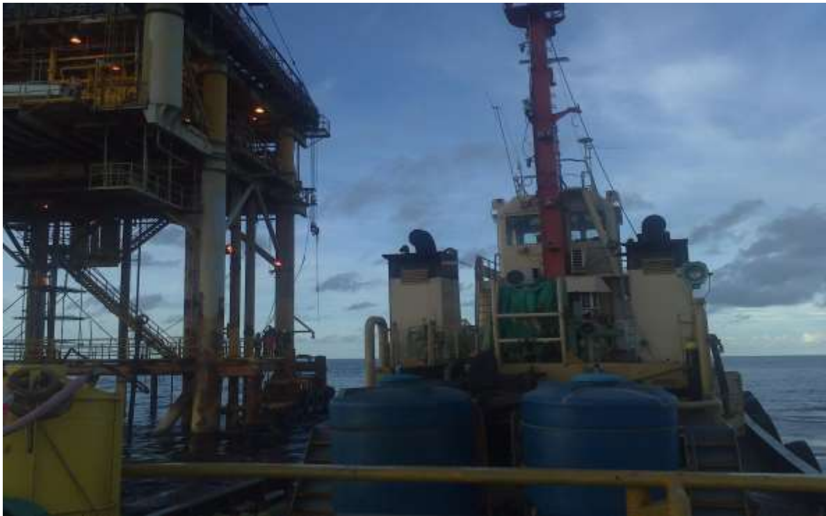
Delivery of Diesel and Aviation fuel for Matinloc oil platform in Palawan.