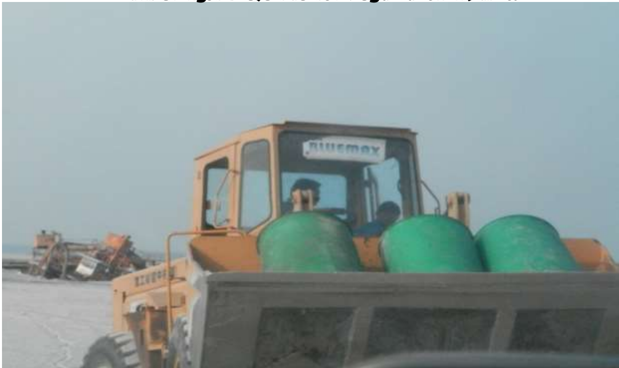
Delivery of Lubes in Zambales sand quarry.