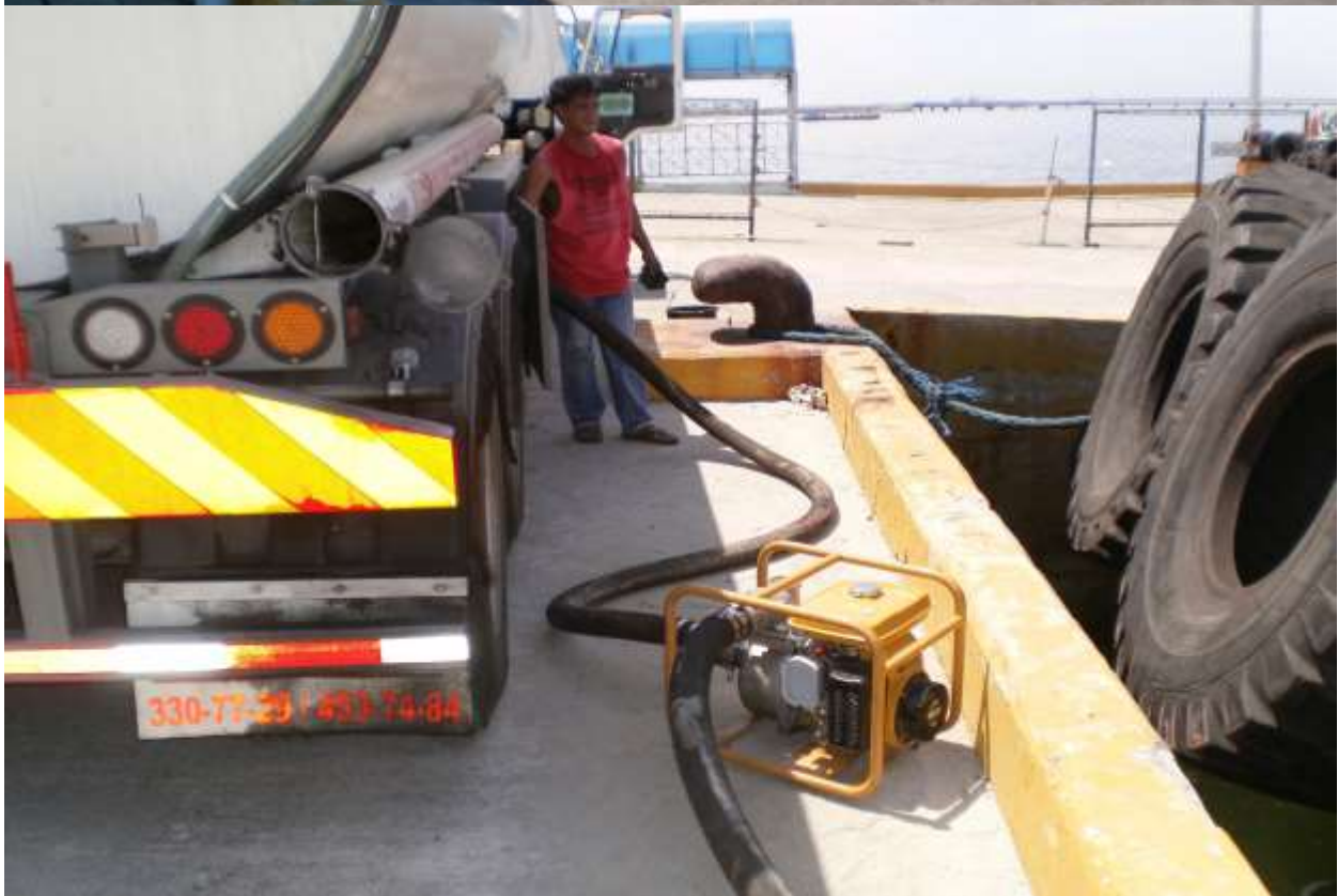
Supply of diesel fuel for tug consumption in Bataan.